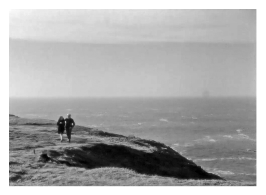
Figure 3.7 Jean Epstein, Le Tempestaire (0:21:27).