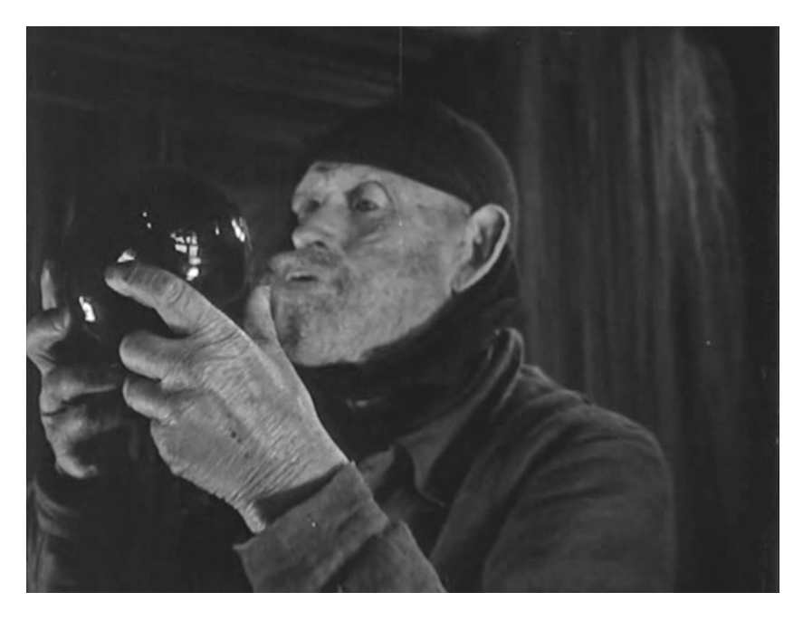
Figure 3.6 Jean Epstein, Le Tempestaire (0:19:14).

glass ball, the roaring surf is televised, and then superimposed with a long shot of the roaring sea coast. Four times in hard cuts, including missing half seconds, the image of the electronic tube cabinet from the lighthouse pops up in between. While the Tempestaire blows on the orb like a bony Zephyr, the filmed surf rewinds backward. Sea and rock separate, spray becomes wave. Finally, the storm calms down, the crystal ball shatters on the floor. Instantaneously, the fiancé appears at the open door, his dry scarf hanging limply. Last scene: the two humans of the future walking between sea, sky and land (Figure 3.7).