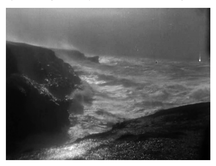
Figure 3.4 Jean Epstein, Le Tempestaire (0:09:54).