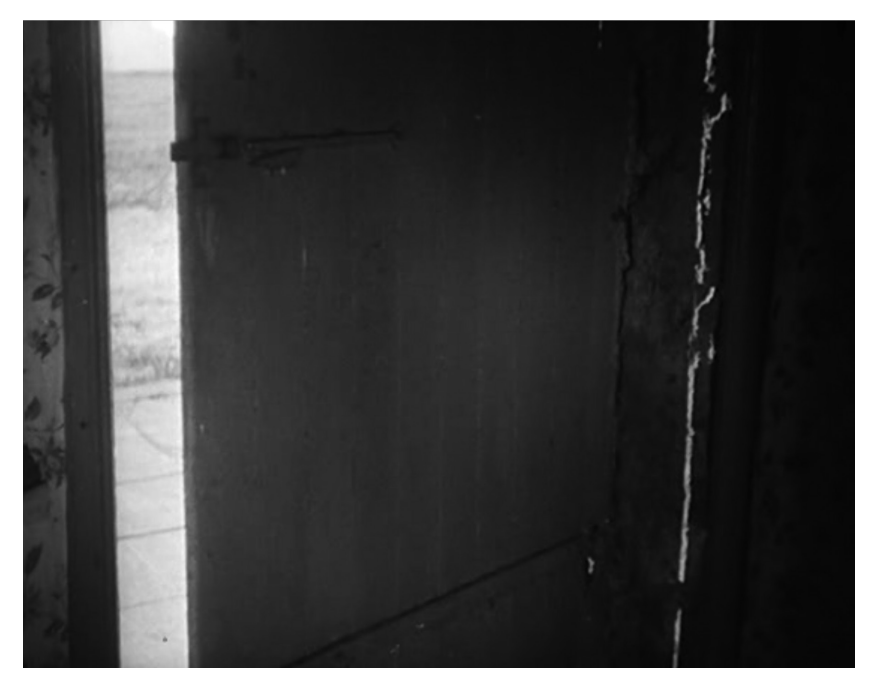
Figure 3.3 Jean Epstein, Le Tempestaire (0:02:32).