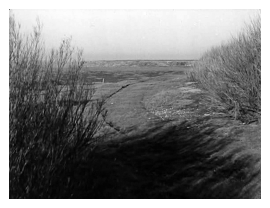
Figure 3.1 Jean Epstein, Le Tempestaire (0:01:21).