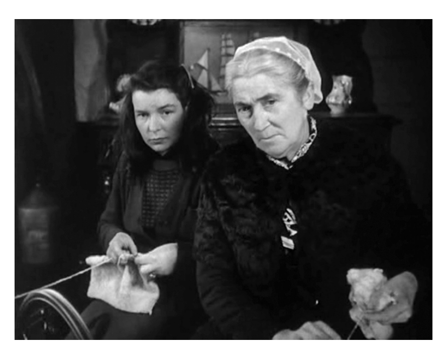
Figure 3.2 Jean Epstein, Le Tempestaire (0:02:28).