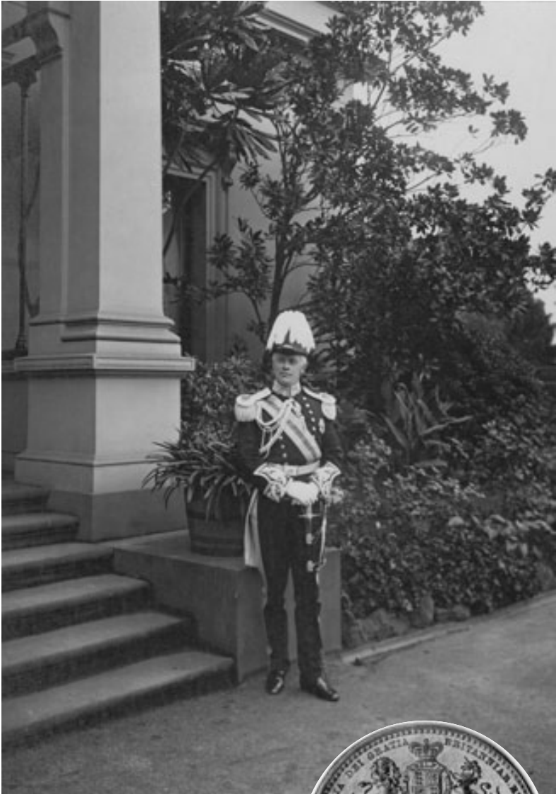
Portrait of Sir Ronald Munro Ferguson