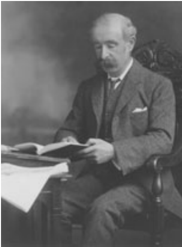
Portrait of Patrick McMahon Glynn, South Australian Federation Leader and MHR

PIC/7055, By permission of the National Library of Australia