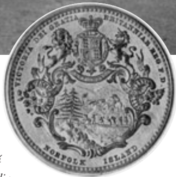
Insert: Norfolk Island Seal Norfolk Island 994.82, plate no. 25114