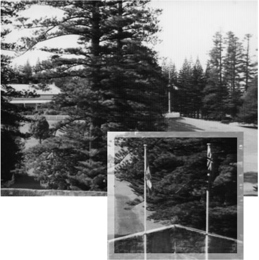
View from the Legislative Assembly towards Government House. Insert: The Norfolk Island and the Australian national flags