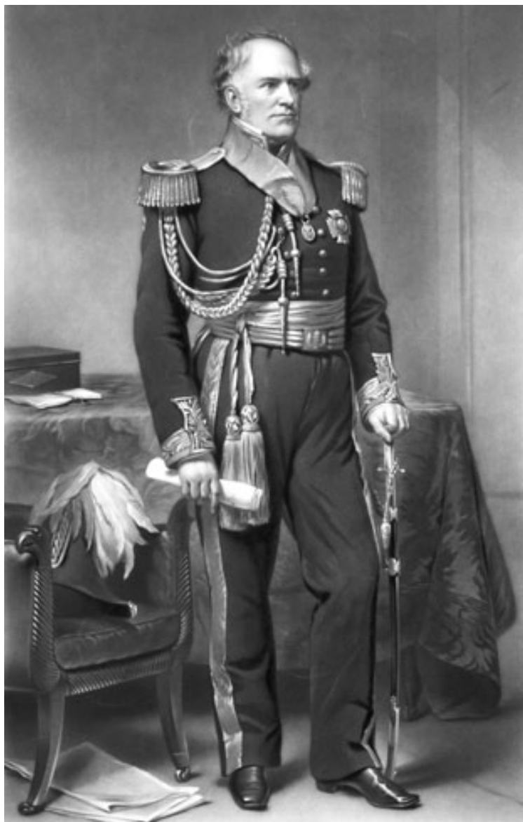
His Excellency Sir William Thomas Denison, K.C.B. &c. &c., Colonel of the Royal Engineers and Formerly Governor General of the Australian colonies, 1863