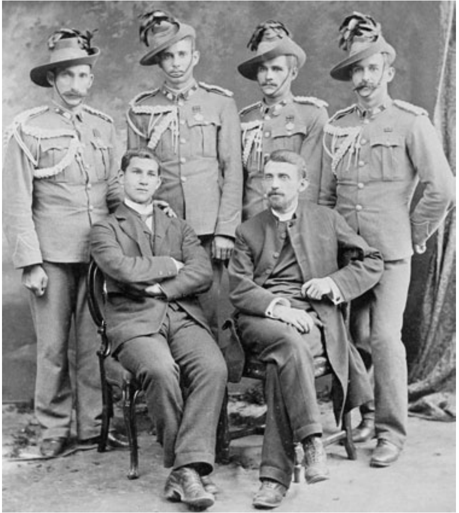
Four Imperial Bushman natives of Norfolk Island, in Commonwealth Contingent sent to London for the Coronation of King Edward VII; also one clergyman and one civilian, London NAA CP697/96