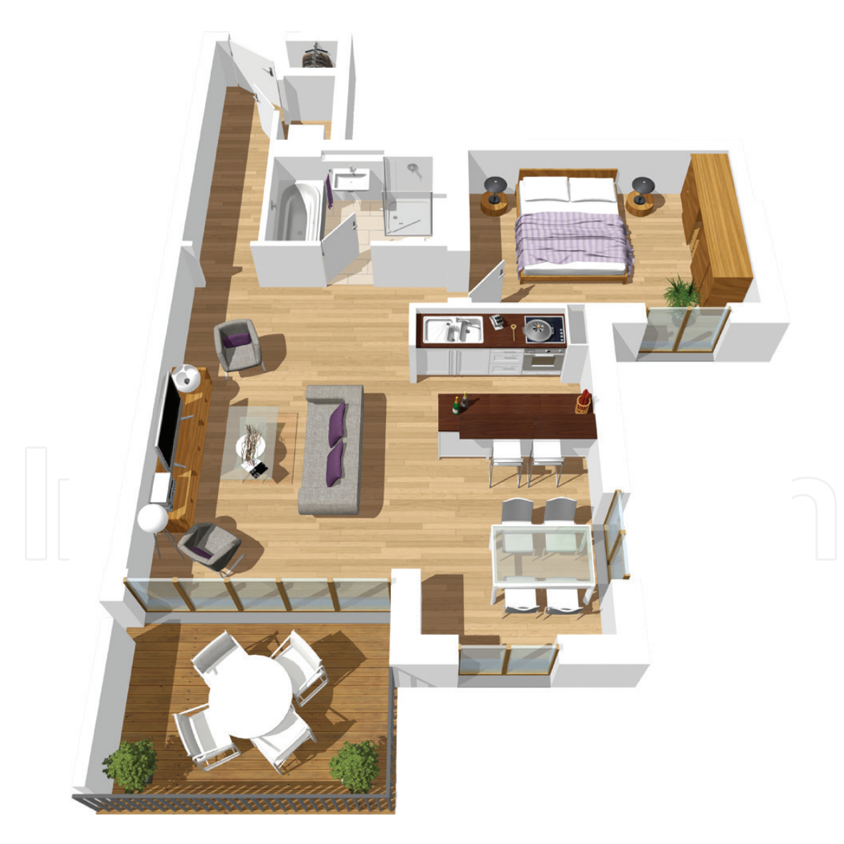
Figure 1. Model of the apartment used in the competitions.