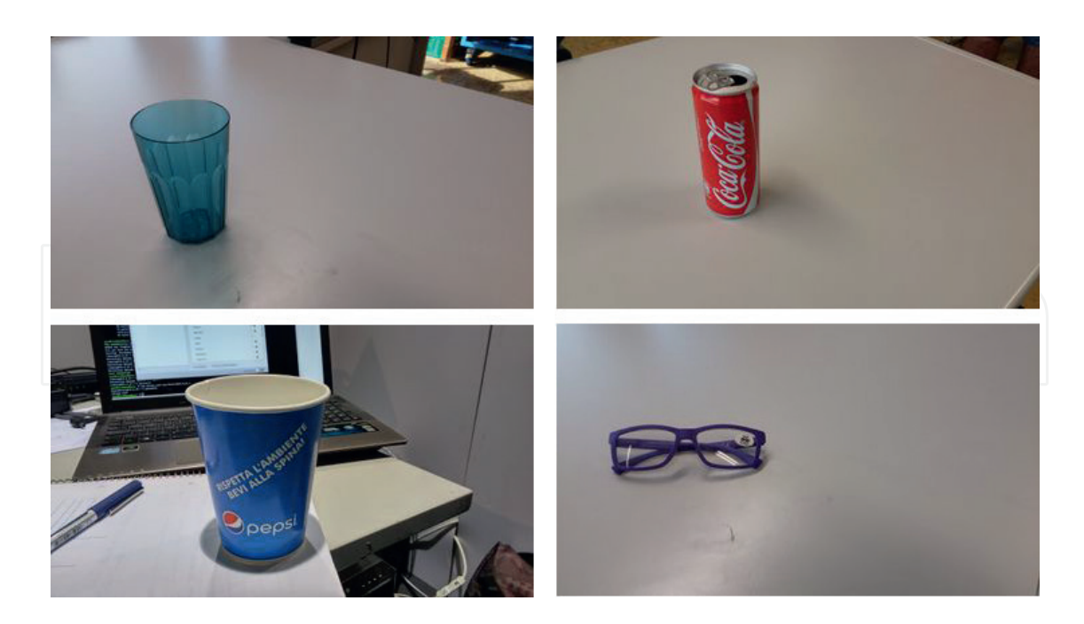
Figure 4. Objects used in TBM3.

bringing the cup back to her. In each run of this task, the robot will be asked to perform several subtasks. Granny Annie may only give one command at a time, and only after the robot executes the corresponding subtask another one may be given.