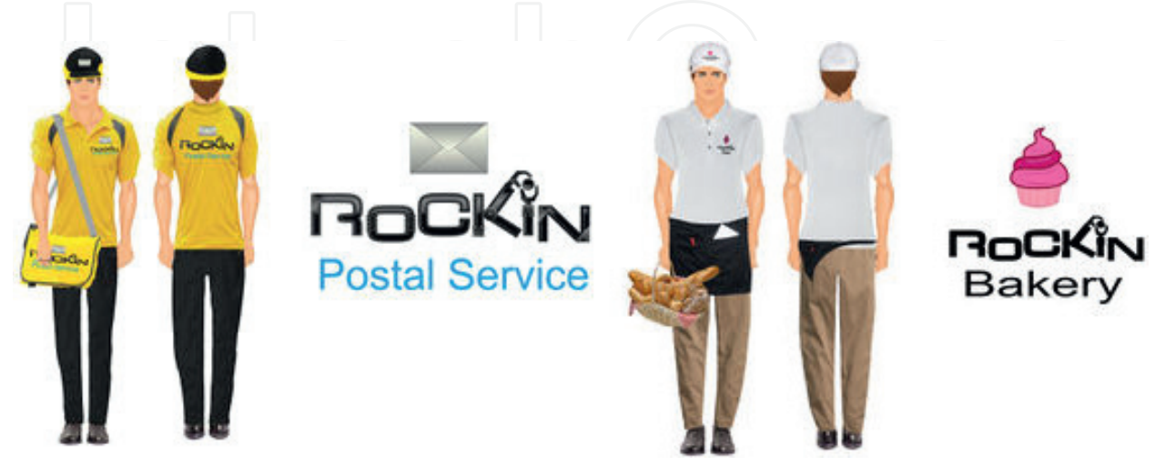
Figure 3. Visitor uniforms for TBM2.

• Phase 1: detection and recognition of the visitor. Whenever a person rings the doorbell, the robot can use its own on-board audio system or the signal from the home automation devices to detect the bell ring(s). The robot has to understand who the person is asking for a visit, using the external camera. If the robot does not detect the ring call after three times, then