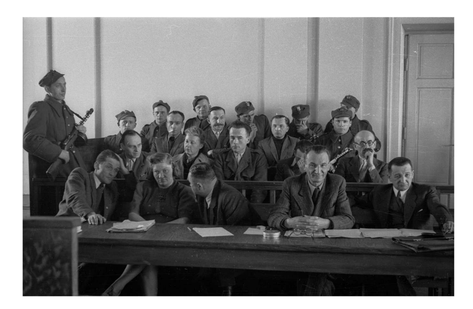
Figure 0.1 Polish war-hero, resistant fighter and spy for the Allied West Witold Pilecki at his show trial in Warsaw on March 3, 1948. Pilecki was executed two months later. At the picture Pilecki is sitting first on the left in the second row. In the first row are the solicitors.

during the interwar years, the protocol was not as lucid with regard to the countries in East Central Europe that fell under Soviet occupation from 1944 to 1945 (Naimark, 2017, pp. 63–65). Stalin himself, apparently lacking a preconceived and consistent blueprint for disseminating the communist revolution to East Germany, Czechoslovakia, Poland, and Hungary, announced the possibility of 'different paths' to communism (Naimark, 2017, pp. 65–70).