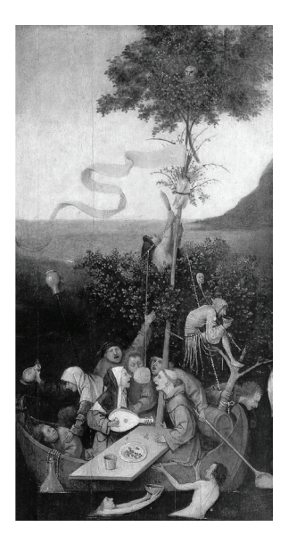
Fig. 1. Hieronymus Bosch, Ship of Fools (1490–1500)