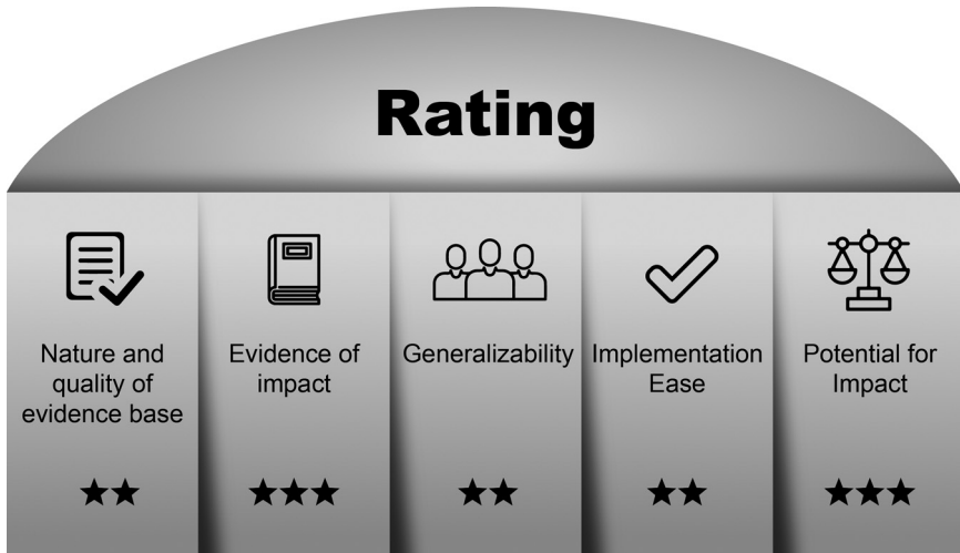
Figure 29.1. School and Community Collaborations to Prevent Student Homelessness Rating of Evidence.

Author Note. There is a need for more high-quality experimental research that trials the effectiveness of school collaborations on student outcomes. Most research on youth homelessness occurs in UK, US and Australian contexts and may not be generalisable to other cultures. The policy requires leadership via a school and community working group to support the establishment of formal partnerships and ongoing collaborations. By schools recognising that student homelessness exists, working in collaboration with community agencies, equipping teachers and school staff with the resources and connections to intervene effectively, and aiming to keep students safe at home or in supportive housing and at school, there is a high likelihood of impact.