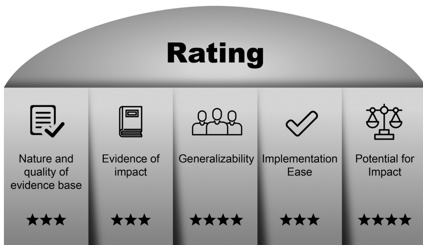
Figure 17.1. Catering for Gifted and Talented Students in the Regular Classroom Rating of Evidence.