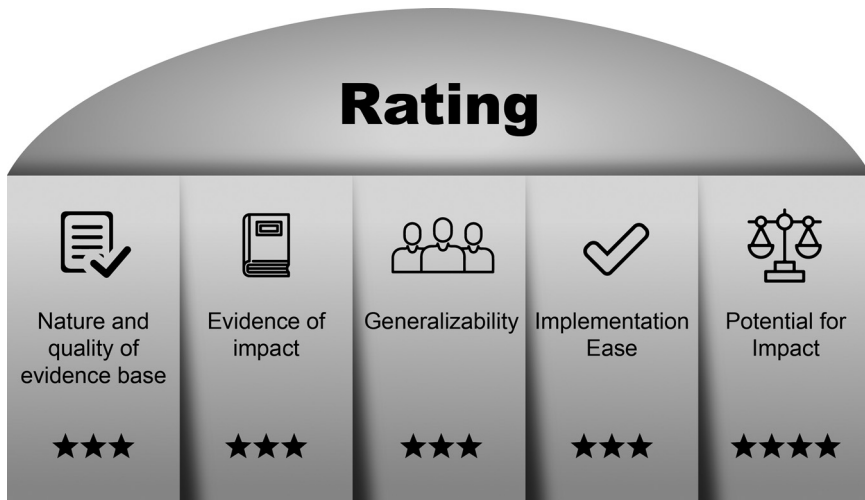
Figure 24.1. The Use of Digital Devices in the Classroom Rating of Evidence.

Author Note. There has been a substantial amount of well-designed empirical evidence supporting some aspects of this policy (e.g., digital distraction, supporting teachers), but other areas (e.g., student agency, digital citizenship) would benefit from further research. There is a need for additional longitudinal research to confirm the impact of the policy statements provided here. Further empirical research focused on secondary school contexts would improve generalisability of findings. In general, the policy could be implemented without extensive cost to schools. Minor to moderate expenditure may be required to ensure networks are adequate and all students have equitable access to digital devices. Digital devices are an integral part of personal and professional life, and teaching students how to self-regulate their use is not only an essential 21st-century skill but could improve learning outcomes.