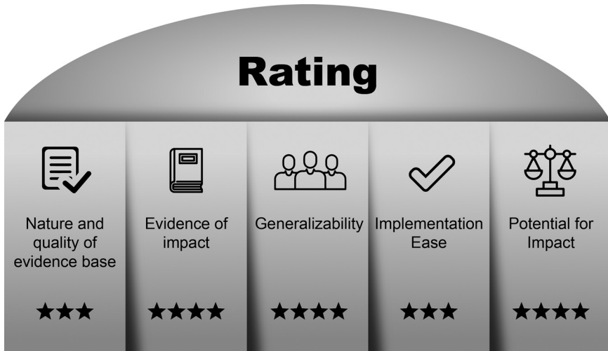
Figure 12.1. Appropriate Staff and Student Relationships Rating of Evidence.

Author Note. For many aspects of this policy, direct research is limited as school staff engaging in relationships outside of those detailed here are in breach of their legal, professional and ethical obligations. Therefore, it is difficult to empirically investigate some of these issues. For this reason, a mixture of empirical research that supports the appropriate behaviours and policy documents from international regulatory bodies was used to develop this policy. There is strong evidence that school staff who reflect on and monitor their interactions with students and parents face a lower risk of developing inappropriate relationships. As the majority of these issues covered relate to ethically appropriate behaviour, the policy documents for a range of international jurisdictions were evaluated for consistency. It does require teachers to consider and adapt their behaviour (especially in online contexts) but not unreasonably so. If school staff limit their behaviour and engage as described, the potential for problematic relationships developing will be substantially reduced.