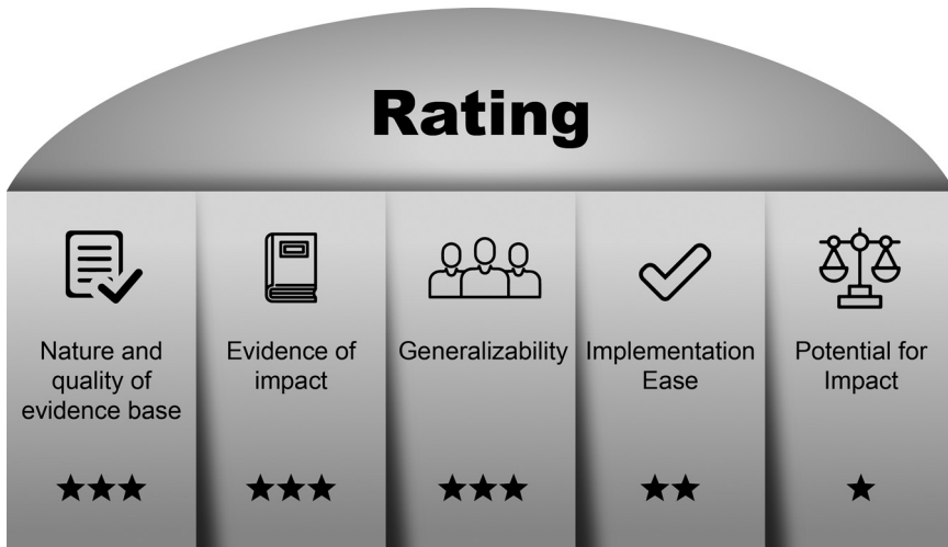
Figure 26.1. Family Engagement Rating of Evidence.

Author Note. There has been a substantial amount of well-designed empirical evidence supporting strong school-family relationships and their impact on student outcomes. These have predominately focused on students' learning skills and academic achievement, with relatively less focused on other student outcomes. More research is needed on the impact of partnerships on teachers and schools. There is a need for further longitudinal studies to confirm the impact of school-family partnerships on students (not only focusing on achievement), families and schools. Most research has focused on families in anglo-philic societies. It takes considerable time and resources to build authentic school-family partnerships, and for some, a significant attitude shift. Authentic school-family partnerships have the potential to positively transform the students' experiences.