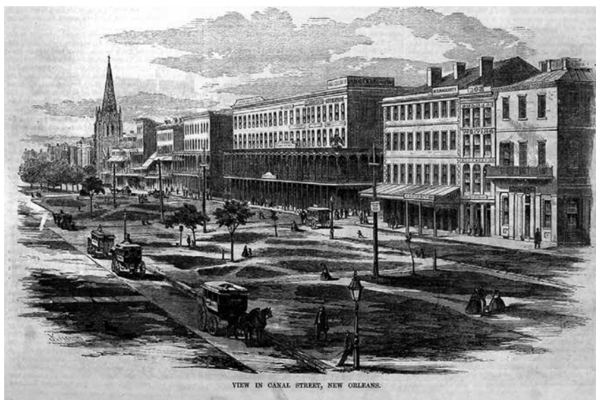
Figure 1. Pencil drawing by Mr. Kilburn, from a photo by James Andrews.

This is an 1857 view of Canal Street, looking almost due north from about Carondelet and Bourbon Streets. The image shows the wide neutral ground as it existed before street railroads were built and there are numerous omnibuses running in every direction.