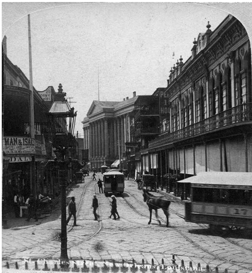
Figure 3. Stereo-card image by J.F. Jarvis circa 1880. St. Charles Street Railroad horsecar 17 is turning from Canal Street into the centre layover track, where another horsecar ahead of car 17 is awaiting its departure time.

of being associated with lower-class behaviour in the eyes of whites. These factors ensured success on the streetcars but their absence in rail and steamship protest weakened any impact on white lawmakers veering towards Jim Crow.