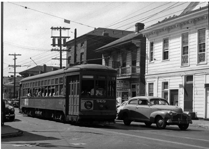
Figure 7. A South Claiborne car on Carondelet Street at Howard Avenue, 1951.

direction in the U.S. Supreme Court as politicians such as Earl Long and deLesseps Morrison became victims of the white supremacy they enforced. Any move towards integration without such legislation would continue to threaten the same political suicide that Huey Long had cited in the 1920s or that Earl Long avoided by signing separate waiting rooms legislation. The burning of the segregation signs allowed Morrison to ensure the city's directive did not weaken, as had occurred during the Baton Rouge boycotts. It also illustrated his commitment to integration on the streetcars. Earl Long's veto of renewed segregation legislation shows a clear separation from the social constrictions of white supremacy that had restricted his brother Huey's abilities in the 1920s.