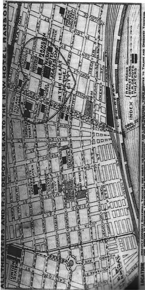
Figure 5. Hotels supplied local streetcar route maps such as this one from circa 1910. Map courtesy of Jack Stewart, Private Collection, New Orleans.

Opposite page: Figure 6. 1904 New Orleans streetcar map shows how the streetcars spread across the city. Map of New Orleans Showing Street Railway System of the New Orleans Railways Company, Map, New Orleans: Walle & Co. Ltd., 1904. From the American Geographical Society Library, University of Wisconsin-Milwaukee Libraries, Web. 26 Aug. 2019.