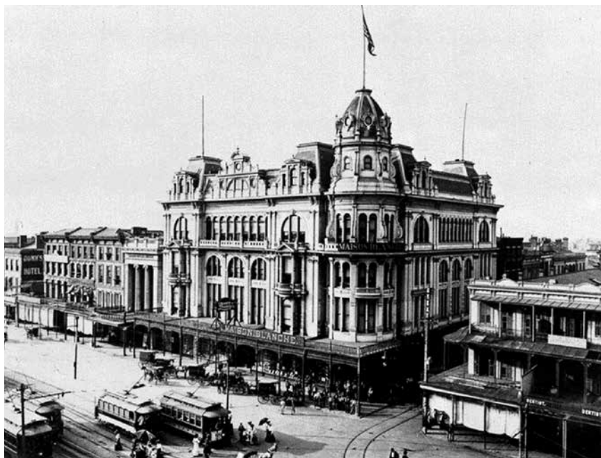
Figure 4. The intersection of Canal and Dauphine streets, 1898, showing early electric cars on all five tracks.