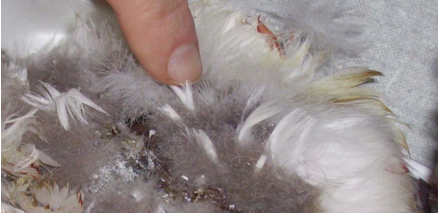
Fig. 3.2 Blood keel feathers in growth

should be dry. No visible infestation of feather inhabiting parasites. Put all feathers from one individual bird in the same envelope. Close, seal and label the envelope. Note which samples it contains (large feather, down feathers, blood keel(s); bird species, [if possible also: sex, growths status (juvenile, adult)], date and location of sampling, name of person sampling. The samples can be stored at room temperature. No preservation is required. They should be shipped by ground or air with adequate protection (bubble wrap envelope) and sent to the isotope laboratory of choice.