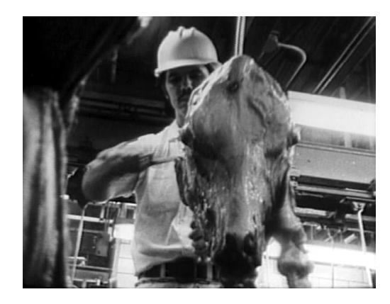
Fig. 8: Film still, MEAT (Frederick Wiseman, US 1976), 00:35:53.

Wiseman's film MEAT (1976), shot at Montfort slaughterhouse and meatprocessing plant in Colorado, shows the industrial processing of beef cattle and sheep, reduced to a thing, but a thing with a face. The workers are often shot on the edge or to the side of the frame, the faces and bodies of the cattle in the centre. While the workers mechanically perform their kill, or single cut, the camera records the faces of the workers (fig. 8), but even more persistently the dead animals – a macabre circle of skinned faces move in a circle like an eerie merry-go-round, workers barely visible behind them (fig. 9).