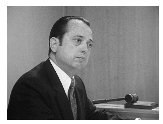
Fig. 10: Film still, JUVENILE COURT (Frederick Wiseman, US 1973), Disc 2, 00:28:20.