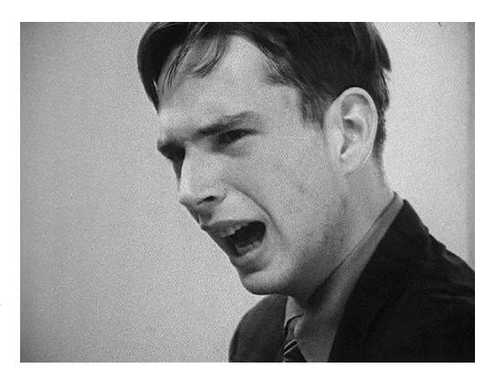
Fig. 11: Film still, JUVENILE COURT (Frederick Wiseman, US 1973), Disc 2, 00:28:56.

also note the judge's rationalising in this case with the aim of doing what he thinks is in the "manifest best interest of this boy" (JC 79). (Even if the judge may be right.)