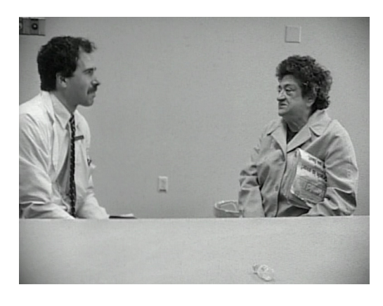
Fig. 3: Film still, NEAR DEATH (Frederick Wiseman, US 1989), Disc 3, 01:24:14.