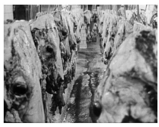
Fig. 9: Film still, MEAT (Frederick Wiseman, US 1976), 00:34:58.