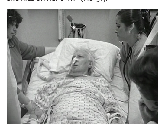
Fig. 4: Film still, NEAR DEATH (Frederick Wiseman, US 1989), Disc 2, 00:41:26.