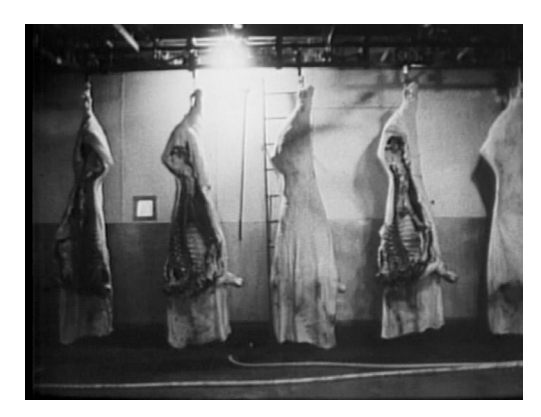
Fig. 12: Film still, MEAT (Frederick Wiseman, US 1976), 00:48:16.

this essay, in relations of doctors and patients in NEAR DEATH (1989), judge and defendant in JUVENILE COURT (1973), assembly line workers and cattle in MEAT (1976), among others. Resistance is usually overcome by the socially powerful one in the dynamic, as we see with the researchers and the spider monkey. Yet Wiseman's films also expose the limits of social power, manifest through physical and aural "democratic noise". The dominant ones in the relation, as we see most explicitly with the workers in the meat-processing plant, may be as benighted as the ones dominated. Along with witnessed moments of social grace, the camera sees something in excess of observed relations of domination in the "is-ness" of the face, alive or dead; in plaintive sounds or alarms; in shorter or longer gaps in vocalisation, between words. Wiseman's lyric portraiture invites possibilities of transformation made by us, found by us, or that find us, suggested in unlikely visual images: carcasses draped in cheesecloth become a parade of dresses (fig. 12), a vault of ribbed flesh sings with light (fig. 13).