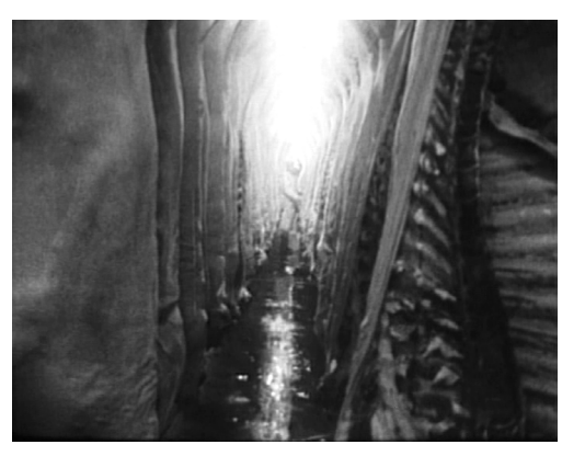
Fig. 13: Film still, MEAT (Frederick Wiseman, US 1976), 00:48:56.