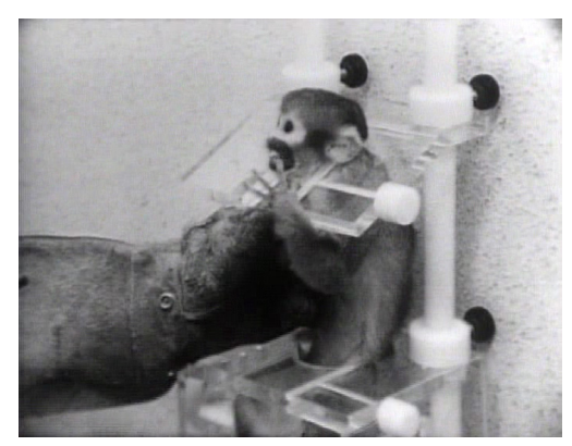
Fig. 5: Film still, PRIMATE (Frederick Wiseman, US 1974), 01:11:32.