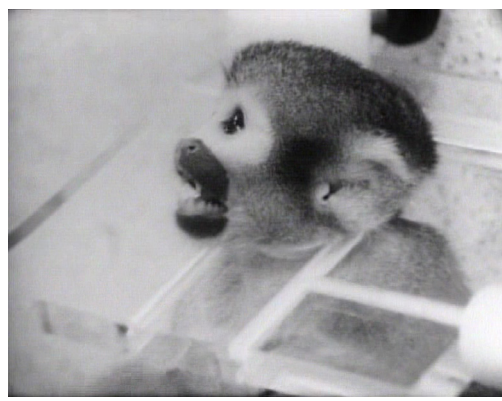
Fig. 6: Film still, PRIMATE (Frederick Wiseman, US 1974), 01:11:32.

Parable happens in the disquieting gap between the deliberative speech of the researchers and the gestural, facial and aural communication of both human and animals. The researchers discuss their observations, experiments, data and the importance of basic research with expressionless faces, a contrast to the mothering attention given to the newborn primates and the primates' range of vocalisation, their gestural and facial expressiveness (some of it agonisingly clear in its messaging, some of it ambiguous). The ambiguity of parable opens up a sense of kinship with these animals, and some alienation from the monotone humans. What lingers, in my perception of the film at least, is not the deliberative discourse, in Panagia's sense of "narratocracy". I am undone by the protest of the spider monkey in all its bodily and vocal resistance to capture; it brings me to a painful place of morethan-reciprocity. Although this is one of Wiseman's early and more polemical films, it doesn't allow the viewer a free pass to judge scientists, for all of us benefit from the medical and other technology that results from curiosity-driven research involving animals. It may also raise questions for the viewer: what aural and physical cues am I missing or ignoring in my daily encounters?