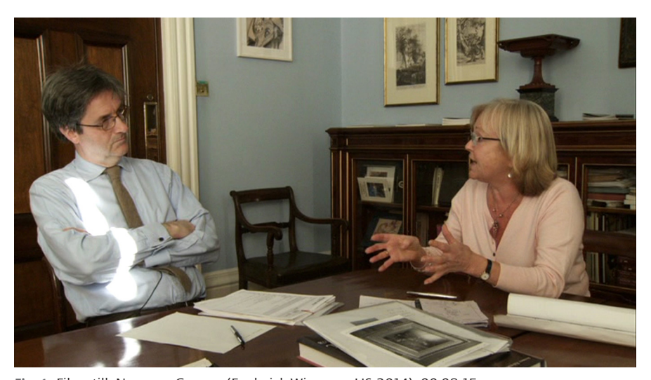
Fig. 1: Film still, NATIONAL GALLERY (Frederick Wiseman, US 2014), 00:08:15.

A medium shot, a man on the left, a woman on the right, seated at a table in a room in the National Gallery in London. The woman says, "And I don't mean this to be a criticism." The man replies, "It's quite clearly not a criticism." The woman speaks in paragraphs about the need to advertise to the broader public what the gallery has to offer. The man says very little. This conversation early in the film National Gallery (Frederick Wiseman, US 2014) gives the woman's sense of what art might be for (a variety of intellectual, emotional, spiritual goods), while the man objects that he doesn't want to "play to the lowest common denominator of public taste" (NG 7), along with non-verbal resistance to her words. In a Wiseman film, what is not said is as important as what is said, if not more so. The woman gestures widely in movements that sweep the table toward the man; making bowing motions, she avoids eye contact for the most part, while he sits, face impassive, arms crossed, leaning away from her, scratching his arm, looking up and away from her, at one point shifting ever so slightly farther away (fig. 1). When he begins to respond with more than "Yes"