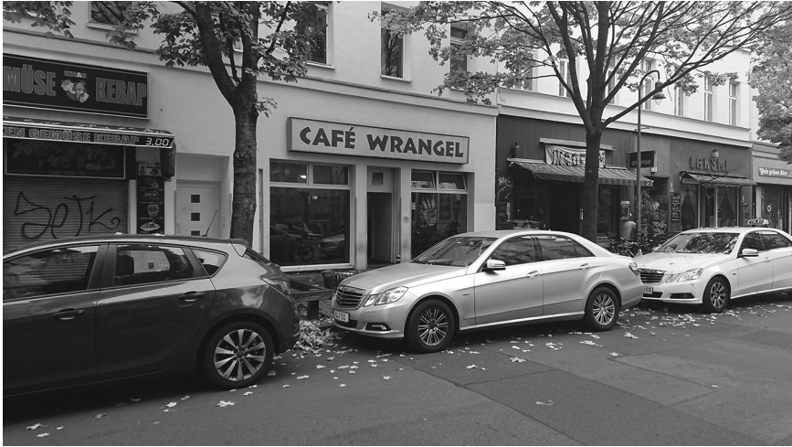
Figure 10.3 Café Wrangel in Kreuzberg, Berlin, a heritage site of sorts, where we conducted interviews with Turkish former guest workers about negotiating identity and belonging in Germany.

The Turks were not the only guest workers: southern Italians, Moroccans, Tunisians, Greeks and others all worked in West German mines or the factories of Daimler-Benz. But it is the large Turkish population that has been at the invisible centre of a lost history of Europe. In his 1975 book A Seventh Man with photographer Jean Mohr, John Berger recognised in the experience and position of the migrant worker (what ‘surrounds him’ both ‘physically and historically’) the ‘political reality of the world at this moment’ expressed in a European story of capitalist modernity based on the unheeding exploitation of others. ‘The migrant is not on the margin of modern experience – he is absolutely central to it’ (Berger and Mohr, 2010 [1975]). Berger’s point can be extended: Europe has come to be as it is, because of the invisible migrant labour which is a fundamental part of its making.