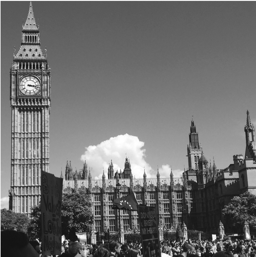
Figure 10.1 ‘Remainers’ protesting against the Brexit referendum result in July 2016, Westminster, London

anti-EU sentiment has positively bolstered European identity (Delanty, 2018, p. 203), as in the case of the EU-flag-waving ‘Remainers’ who protested against Brexit in their tens of thousands in the streets of Westminster (Figure 10.1). In our time at HEH we also encountered people who had not really considered or championed their ‘European’ identities until political events like Brexit compelled them to do so. When do identity formations come into view? Anthony Giddens discusses Vaclav Havel’s meditation on the timing of European identity as a recent development in its conscious and reflexive form. It is recent because identifying ourselves is now and only now a pre-requisite for co-existing with others in a ‘multicultural and multipolar world’ (Havel in Giddens, 2014, p. 152). If European identity was largely unreflexive until recently it was, Havel argues, because Europe felt that it was the world, making identity superfluous. In other words, a new consciousness of otherness, of disparate positions and our