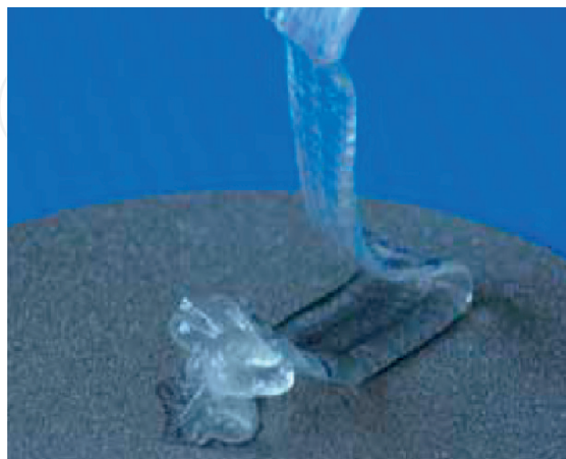
Figure 2. DAC ® HA-g-PLA, fast-resorbable, hydrogel coating. Composed of covalently linked hyaluronan and poly-D, L-lactide, the “Defensive Antibacterial Coating” (DAC ® , Novagenit Srl, Mezzolombardo, Italy) is the first antibacterial-coating cleared for clinical use in orthopedics, trauma, dentistry and maxillofacial surgery in Europe.

Composed of covalently linked hyaluronan and poly-D,L-lactide, the “Defensive Antibacterial Coating” (DAC ® , Novagenit Srl, Mezzolombardo, Italy) was specifically developed in order to protect implanted biomaterials used in orthopedics, traumatology, dentistry and maxillo-facial surgery from bacterial colonization [24, 48] (Figure 2).