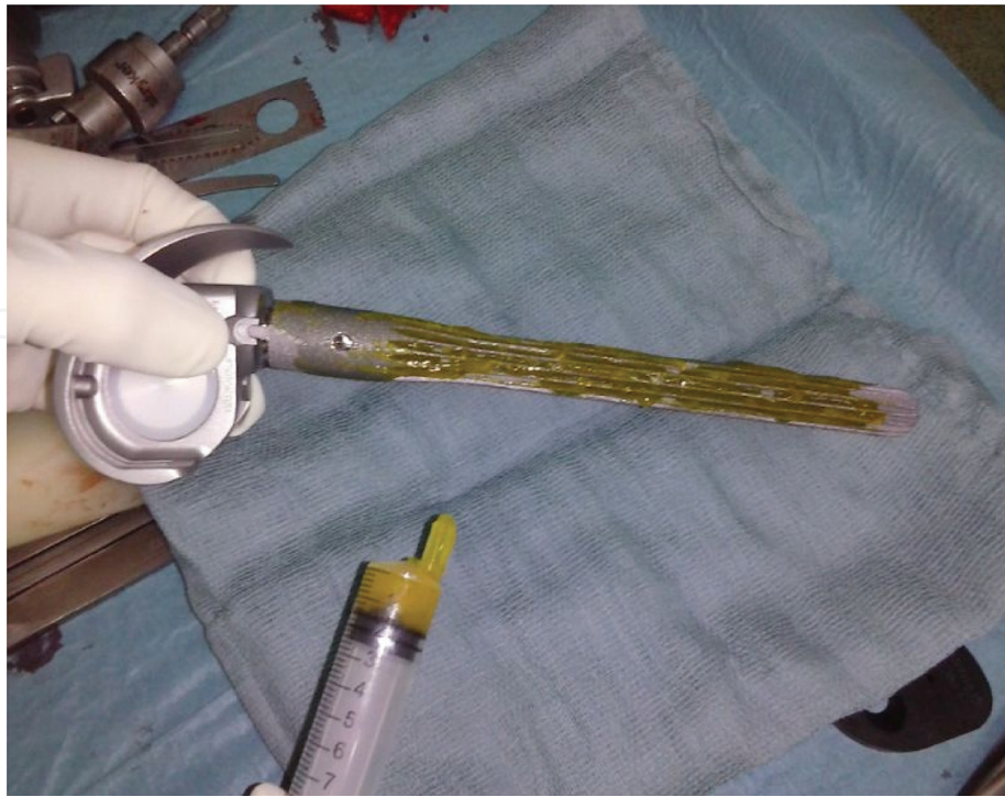
Figure 5. Tigecycline-loaded DAC ® hydrogel coating, applied at surgery on a knee revision prosthesis. The hydrogel, which comes in a powder form, in a prefilled syringe, is designed to be reconstituted at the time of surgery with water for injection. The surgeon may decide to add a single or a combination of antibiotics to the water for injection, to further enhance implant protection.

scanning electron microscopy (SEM) analysis [37]. This is an important requirement in order to reduce the exposed surface of a biomaterial, thus creating a uniform coating of the surface and leaving no pores or cracks that could eventually be colonized by planktonic bacteria.