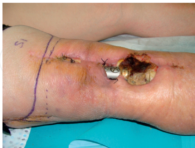
Figure 1. Infected, exposed, knee prosthesis in a 60-year-old woman. Approximately one million joint replacements are performed annually in Europe, and infection is currently among the first three most common reasons for failure of implants. Septic complications are associated with prolonged and complex medical and surgical treatments, often leading to implant removal. Poor functional results, possible infection recurrence, risk of amputation and increased mortality rate are all well known and feared consequences of periprosthetic and implant-related infections. Direct costs of treatment of periprosthetic infection exceeds 100,000 euros, per case, according to a recent analysis [7].

Hyaluronic acid (HA) is mucopolysaccharide, occurring naturally in mammals. It is abundant in skin and in connective tissues, being one of the main components of extracellular matrices. HA has several clinical applications in dermatology, esthetic surgery, dentistry, urology, orthopedics and ophthalmology [20]. In fact, due to its high biocompatibility, and nonimmunogenicity, hyaluronic acid is considered as an ideal biomaterial for medical and pharmaceutical applications [21, 22].