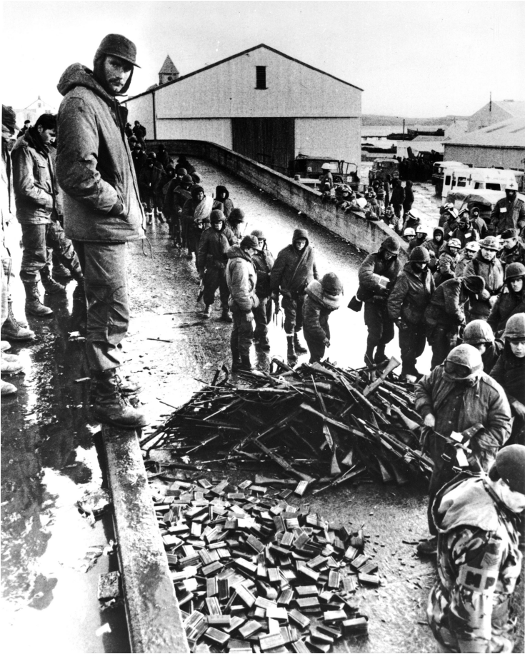
Figure 2 Argentine soldiers surrender their weapons in Port Stanley

‘WE’LL SMASH ’EM’ and ‘STICK IT UP YOUR JUNTA’ ( Sun , 1982: 3.5.82; 5.4.82; 27.5.82; 3.4.82; 7.4.82). 2 The media’s full-speed advance on the South Atlantic, all headlines blazing, left little scope, and few column inches, for the expression of some of the genuine anxieties raised by the nation’s precipitate commitment to recover the islands – anxieties about the military’s preparedness, expertise and equipment; anxieties about the political pitfalls