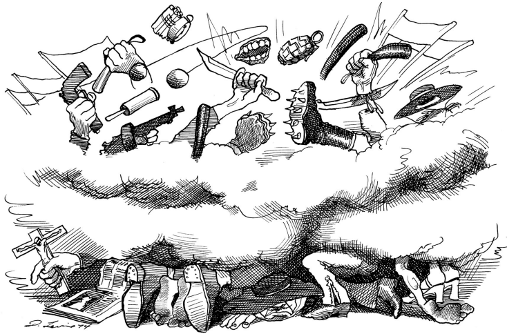
Figure 8 ‘Argentina’ (Cartoon: David Levine)

the caudillo returns to lead his people out of the wilderness and ‘resanctify the land’ (Naipaul, 1980: 104). Yet in providing a focus for their disputes, Naipaul presciently observes, Peronism will not resolve the people’s antagonisms but become ground zero for their detonation. The New Jerusalem it promises is leading the country straight to hell.