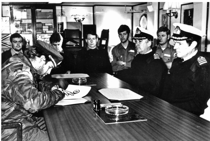
Figure 1 Captain Alfredo Astiz surrenders the Argentine garrison on South Georgia

put up by Argentine land forces, many of them conscripts; and nothing about the many underlying causes of their ultimate defeat – poor training, poor leadership, poor lines of supply. What we see instead is a familiar procession of stereotypical Latinos – cowardly torturers, deflated braggadocios and mobs of unruly civilians behaving with a predictable disregard for decorum. Indeed, what we see in these pictures is less an historical record of Argentina's doomed endeavour to recover the islands than the projection of an ongoing and deeply rooted set of British prejudices about Latin America, its peoples, their histories and cultures. Little wonder that these images say so little about the Argentine experience of the war as it is British perceptions of and responses to it that they principally record.