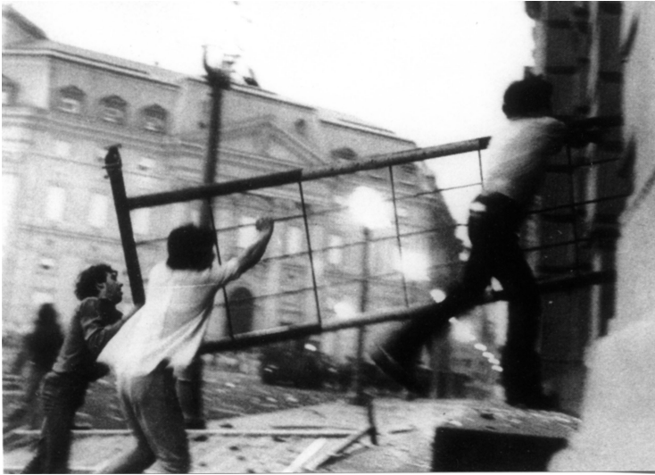
Figure 3 Argentine civilians rioting in the Plaza de Mayo

of what seemed to be an anachronistic gesture and the public's willingness to support it; anxieties about the legitimacy of Britain's continuing status as a world power, the fear that, as the Prime Minister of the day Margaret Thatcher put it, 'Britain was no longer the nation that had built an Empire and ruled a quarter of the world' (quoted in Barnett, 1982: 150). While the British press, with the exception of the Guardian and the Financial Times , remained conspicuously silent about such concerns, parliamentarians from both sides of the House gave vent to their anger over what had happened, and so betrayed their trepidation over what was yet to come. As the Tory grandee, Sir Julian Amery, indignantly observed in the first Emergency Parliamentary Debate called in response to Argentina's seizure of the islands: 'The third naval power in the world, and the second in NATO, has suffered a humiliating defeat' (Barnett, 1982: 38). Patrick Cormack, also from the government benches, noted that humiliation not only engendered the determination to redeem the situation and restore the nation's credibility but also excited the fear that this might not be possible. Indeed, Edward du Cann wondered if the nation