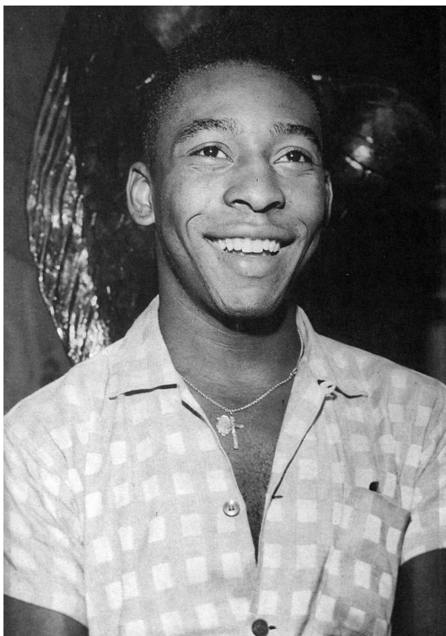
Figure 7 Pelé in 1966: the 'good son, the loyal friend, the patient idol'

Despite his wealth and fame, Pelé remained affable, open and endearingly modest, a magnet for the nation's affection and an embodiment of its highest virtues – in the words of Aldemar