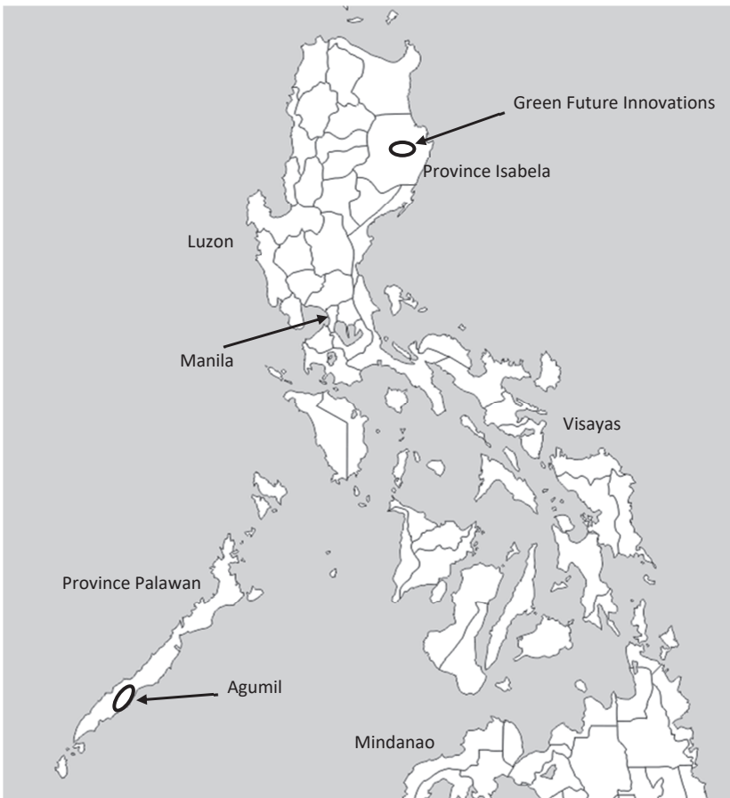
Figure 6 Map of the Philippines (Cutout)