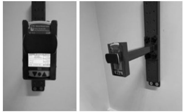
Figure 1: Isometric neck strength testing equipment

Isometric neck strength was measured using a PD (Lafayette Dynamometer, Model 01165, Lafayette, California, USA) and a custom-built steel bracket, which was mounted to a wall in the University Strength and Conditioning Suite (Figure 1).