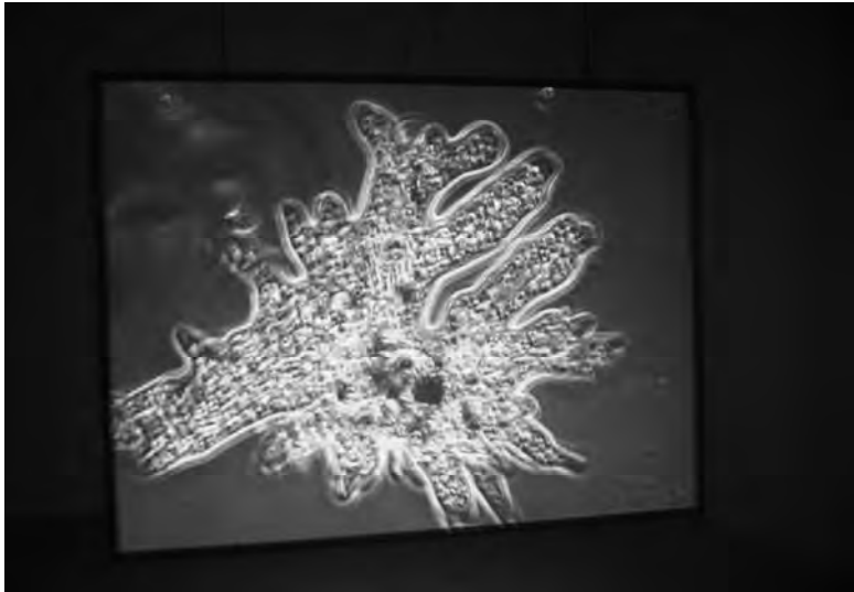
Figure. The exhibition entrance (above), and a screen with a moving amoeba in the room The Depth of the Surface (below).