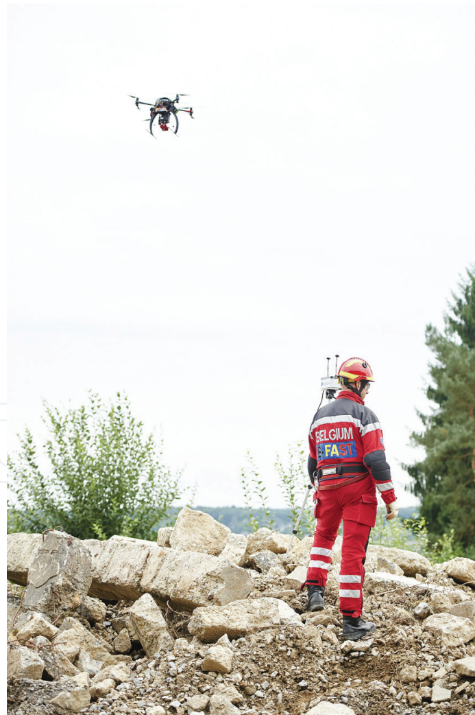
Figure 5. Collaboration between aerial rescue robots and human rescue workers.