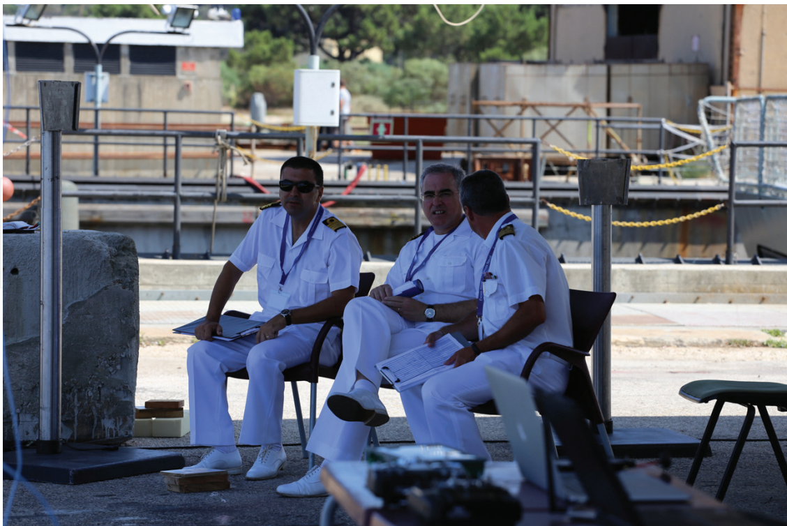
Figure 9. Expert Navy officers evaluating the performance of the ICARUS marine tools.