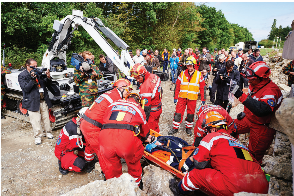
Figure 8. Safe collaboration between human search and rescue workers and heavy robots.