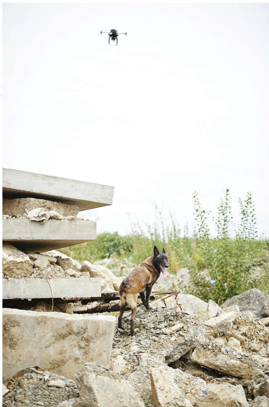
Figure 6. Collaboration between aerial rescue robots and canine rescue assets.

the (ultrasound) noises made by aerial robots). This trial turned out to be very successful and showed that dogs and aerial search teams are not only capable of working side by side, but that they are complementary tools, as the dogs were very capable in locating victims hidden on or under the ground in demolished buildings, whereas the aerial tools were very capable of locating victims trapped at a higher level (e.g., on rooftops).