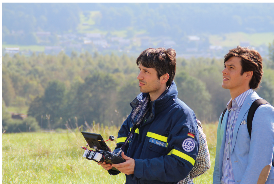
Figure 7. End user controlling ICARUS unmanned aerial system.

Simulated crisis response exercises are extremely useful, but the real operational validation of unmanned technology in search and rescue missions can only be done in a real-life operation. Therefore, the ICARUS team did not hesitate when ICARUS partner B-FAST was deployed to Bosnia in 2014 to help with flood relief operations after massive inundations to send along an expert in robotics and an unmanned aerial system (see also [9] and Chapter 10). The mission was highly successful, providing assistance on the crisis sites not only for several international relief teams [B-FAST, Technisches Hilfswerk (THW), ...], but also for the Bosnian Mine Action Centre (BiHMAC). Figures 10 and 11 show how these relief teams were brought into contact with the new technological tool, provided by ICARUS, in collaboration with the