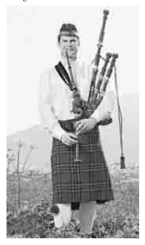
Figure 5.1. Ex-Mr Switzerland Renzo Blumenthal Celebrates his 'Scottish Genes'.

of their way of life in the mountainous country. The ex-Mr Switzerland speaks the old language of Rhaeto-Romanic still found in parts of his alpine home region, the Grisons (Vella im Val Lumnezia), where he lives with his cows of the Swiss Brown breed. The Swiss tourism agency used the image of Blumenthal as a Homo alpinus to lure German women into Switzerland during the World Cup of 2006 that took place in Germany. The slogan 'Switzerland's most handsome man Renzo Blumenthal grins after milking a satisfied-looking cow' on Spiegel online is accompanied by a photograph of Blumenthal as pure 'Swissness' (retrieved 1 March 2011 from http:// www.spiegel.de/fotostrecke/fotostrecke-13416-3.html). But iGenea has made out a Scottish ancestry (eleventh and twelfth centuries) for this essence of 'Swissness'. The myth of an original Swiss people à la Homo alpinus is here only evoked to be refuted. The subversion is wonderfully visualized in a photograph showing Blumenthal in a kilt and with pipes (see Figure 5.1). Furthermore, despite the DNA test, Blumenthal is a Scot by choice, because his maternal ancestry has been traced to Germanspeaking Europe for the same time period (Bieler 2007). That Blumenthal chooses to appropriate the Scottish identity must be attributed to the current Scottish ethnohype as it is celebrated in films, at festivals, by music bands and in computer games (see Hesse 2008) rather than to a biological determinism associated with DNA testing.