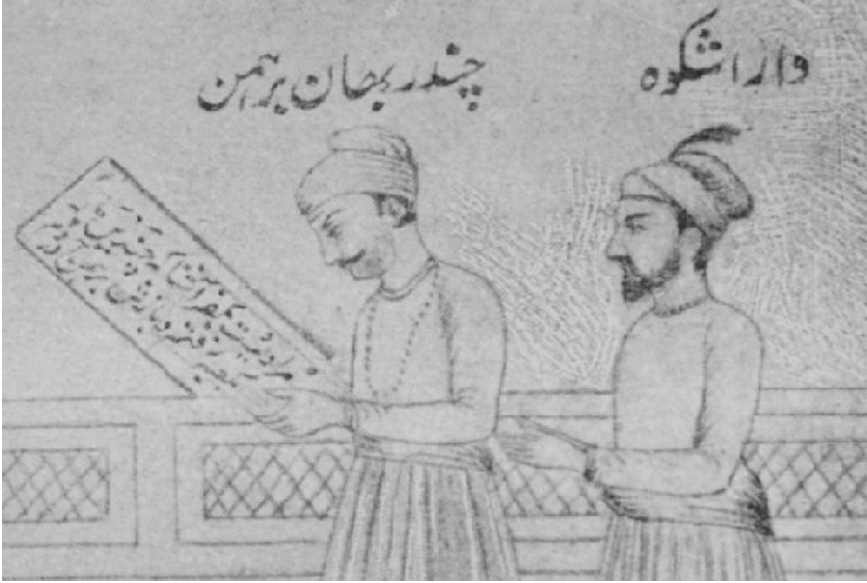
FIGURE 2. Detail of Figure 1, close up on Dara Shukoh, Chandar Bhan Brahman, and a writing tablet.

And thus in the case of Chandar Bhan it is not the recorded texts of history or even his own writings that have served as the primary reference point for the remembrance of him. Rather, it is this “sequence of articulations” in the tazkiras that have come to be preserved, and memorized, on the imaginative tablet upon which much of his legacy has been written for him.