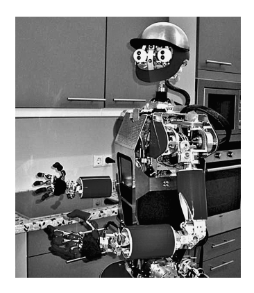
Figure 1: The humanoid robot ARMAR III (SFB 588) of KIT, Germany, by Jens Ottnad.

Humanoid robots are robots whose shapes are modelled on the human body. They have two legs, two arms, a torso, and a head and also joints (legs, arms, shoulder) which are designed for movements similar to those of humans. Anthropomorphic robots are also of "human shape" in a literal sense. The publications on robotics do not make a distinction in the use of these descriptions. Literally translated, "android" robots or "gynoid" robots are of the shape of a man or a woman. In some publications these terms are used to describe humanoid robots whose appearance is "confusingly similar" to a man or a woman: "an artificial system defined with the ultimate goal of being indistinguishable from humans in its external appearance and behavior" (MacDorman & Ishiguro 2006, p. 298). Typically they are covered with a skin-like coating, are apparelled and make – often rudimentary – facial expressions. In contrast, humanoid/anthropomorphic robots can be identified as robots "at first glance":