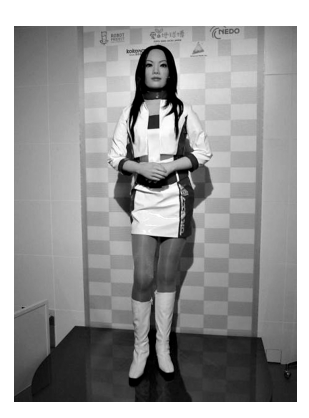
Figure 2: The "gynoid" robot ACTROID-DER, developed by KOKORO Inc. for customer service, appeared in the 2005 Expo Aichi, Japan. The robot responds to commands in Japanese, Chinese, Korean, and English.<sup>4</sup>

So the special humanoid shape has to be added to the general definition of "robot." The complexity which is requested in the definition of robots (see above) generally exists within humanoid robot systems, the descriptions in the humanoid robots catalogue on the web site of the SFB 588 "Humanoid Robots – Learning and Cooperating Multimodal Robots" may confirm this (SFB 588).