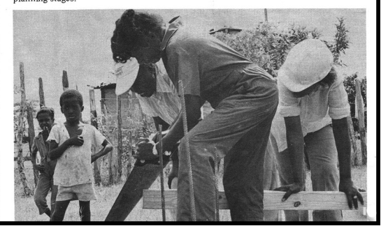
FIGURE 3.4 Report on women workers in the Women's Construction Cooperative in Sistren magazine.

Our children learn from our example and what could be a better example for the children of flood-stricken Clarendon, especially the little girls, than the workers of the Women's Construction Cooperative (WCC). The traditional idea that women are physically unable to work in construction is unlikely to carry much weight with this little girl (left) who started mixing cement and building a doll's house after watching WCC members (right) get down to constructing houses for flood victims. The WCC is currently providing skills free of charge to re-build the houses. Materials have been donated by the Dutch Government. The WCC has not only recently moved its offices to 9½ Lincoln Avenue (off Brentford Road), but is expanding its training programme. Some 20 women, from Majesty Gardens in Kingston, Port Royal and Port Antonio are currently in training. Projects on stream include furniture making for the island's new Women's Centres and the basic school at Olympic Gardens; construction of three clinics — two in Kingston and one in Port Antonio; refurbishing of the Police Married Quarters at Port Royal and construction of community toilet facilities for Majestic Gardens. Construction of a community centre in Accompong, St. Elizabeth, is in the planning stages.