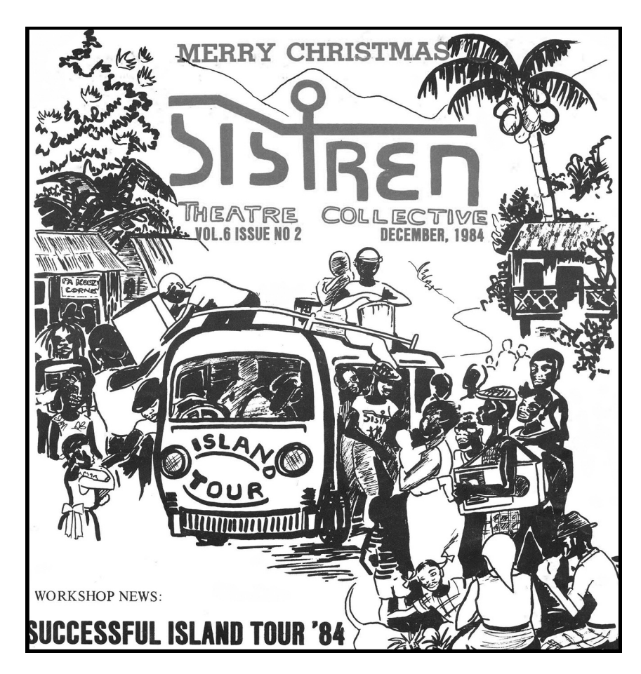
FIGURE 3.1 Cover image of an early Sistren newsletter reporting on the collective's theatrical performances.

movements. Jamaica's neoliberal trajectories of development, staunchly Christian beliefs of large sections of the population, and heteropatriarchal codes are entangled with Euro-colonization and male nationalism.<sup>6</sup> The question I ask in relation to women's, gay, and lesbian activism is this: if identities come into being in relation to larger bio-political issues and languages of power then under what conditions does space for LGBTQ+ identities and struggles become a political possibility in Caribbean societies like Jamaica? Caribbean and Latin American decolonial feminist thought - especially Sylvia Wynter and Maria Lugones's revisions of Anibal Quijano's concept "coloniality of power" - are useful in answering this question (Wynter 1990; Lugones 2007). Too, policy documents and publications by transnational feminist organizations such as CAFRA and DAWN, housed in the Women's and Development Unit (WAND), Barbados from 1990–1996 provide a possible roadmap