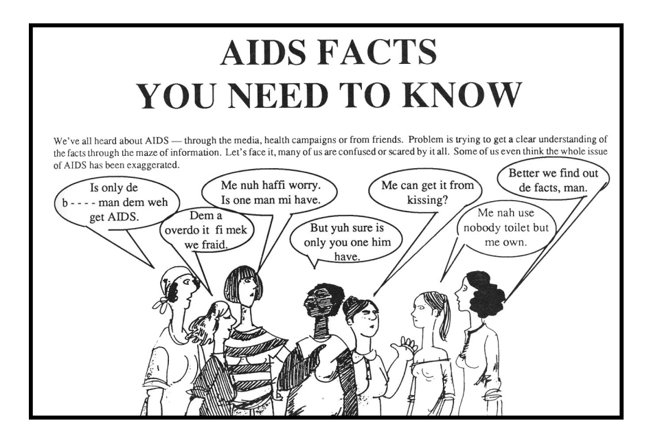
FIGURE 3.5 Section of a graphic dispelling common misunderstandings of AIDS in Sist ren magazine.

Several Caribbean nations have debated feminist demands for legalizing abortion over the past half century. A report on the gender development indicators for Jamaica states: "All men and women regardless of creed or race, should have access to the law for redress even from culturally differentiated gender practices" including women's access to "contraceptives and...the freedom to control childbearing if they decide to do so," and men's right to "share in the care, support, and upbringing of their offspring" (Mohammed 2000, 7–8). The 2011 amendments to the Jamaican Constitution include a Charter of Fundamental Rights and Freedoms offering similar gender-based protections as in the report but exclude sexual and reproductive choice as the basis of such protections. As the trajectory of the magazine demonstrates, women's alternative media in Jamaica historically addressed "culturally differentiated gender practices" in somewhat unequal terms; while the right to reproductive choice has been clearly expressed, the right to sexual choice has not been articulated forcefully or clearly. The influence of various denominations of Christianity in Jamaica