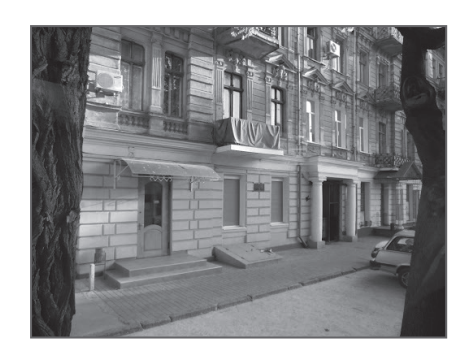
Bialik's house, Lower Arnaut Street, Odessa

Ostensibly, the story mouths the clichéd slogans of the Party line, but the ambivalence of the authorial position is unmistakable: the Galician Hasidic rabbis come to see Judaism on trial; the old attorney for the defense, Lipking, makes a ridiculous figure in a Soviet court; the mohel (ritual circumciser) Naftula reminds the public prosecutor that he too was circumcised and born Zusman—all of this emphasizes the fate of Jewish Odessa and a final end of a thriving literary center that could be referenced only in the subtext.