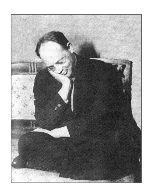
Babel' in a humorous photo published alongside Budenny doing gymnastics (1933)

1924, succeeded by Stalin. A short piece about a mutiny on board a foreign ship, "You Missed the Boat, Captain!" ("Ты проморгал, капитан!"), dated the day of Lenin's funeral, used stylistic contrasts to make a political point, but it was flimsy stuff, and Babel' did nothing to mitigate the ambiguity of the narratorial position in the Red Cavalry stories. The literary journals reverberated with the polemic over whether political correctness and an uncritical portrayal of the Bolshevik Revolution should be the sole yardsticks by which writers were to be judged, and in December 1924 the Red Cavalry stories were subjected to a public debate arranged by the Moscow daily, Vecherniaia Moskva. Vladimir Veshnev, writing in Molodaia gvardiia, complained that Babel' and other fellow travelers subjected the October Revolution to their moral judgment, rather than the other way around. Veshnev clearly saw the result of this independence of conscience and insistence on the writer's freedom in Babel's poeticized portrayal of the Odessa gangsters and Cossacks. <sup>40</sup> Similarly, the critic Georgii Gorbachev, while comparing Babel' to Heine and praising his innovative contribution to Russian literature, nevertheless asserted that Babel's romanticism was unacceptable in the current revolutionary times. He called Babel' a cynical aesthete who had backed the Reds and not the Whites