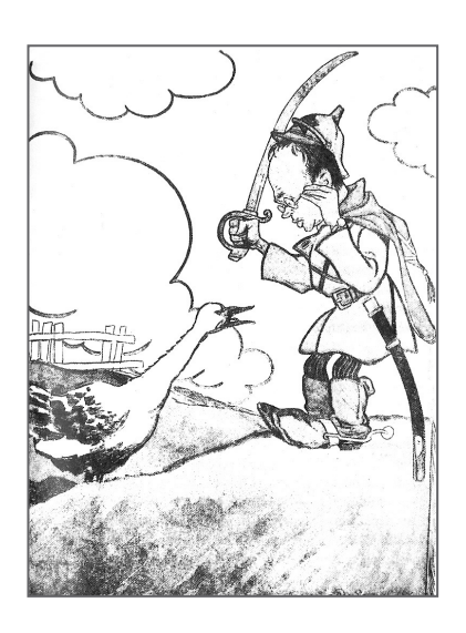
Two versions of Boris Efimov's caricature based on "My First Goose"; the "Jewish" reading (on the left) was never published (Russian State Archives of Literature and Art, Moscow)