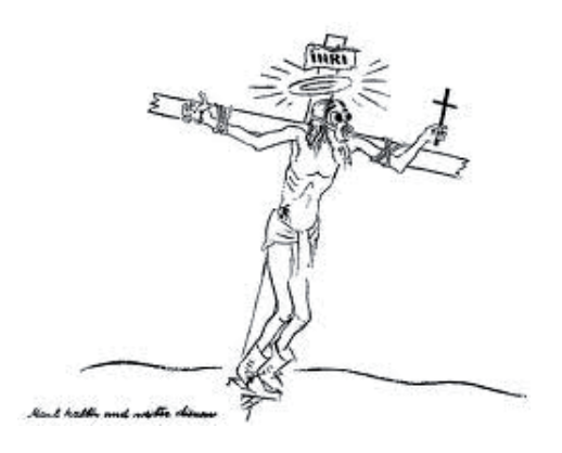
George Grosz, "Maul halten und weiter dienen"