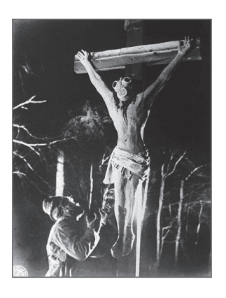
Fridrikh Ermler, Fragment of an Empire, 1929

Я видел: человека в оранжевом кунтуше преследовала ненависть и настигала погоня. Он выгнул руку, чтобы отвести занесенный удар, из руки пурпурным током вылилась кровь. Казачонок, стоявший со мной рядом, закричал и, опустив голову, бросился бежать, хотя бежать было не от чего, потому что фигура в нише была всего только Иисус Христос — самое необыкновенное изображение бога из всех виденных мною в жизни.