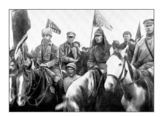
First Horse Army, 1920