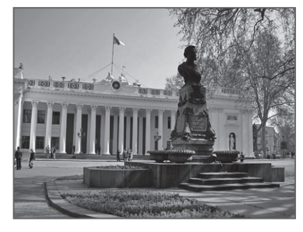
Monument to Pushkin, Odessa