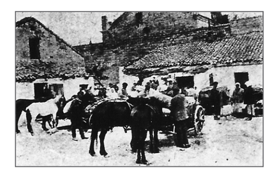
Odessa tavern, reputedly Liubka the Cossack's (ca. 1925)