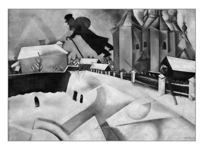
Marc Chagall, Over Vitebsk. 1915-20 (after a painting of 1914). New York, Museum of Modern Art, New York, oil on canvas, 26 3/8 x 36 1/2 (67 x 92.7 cm). Acquired through the Lillie P. Bliss Bequest. 277.1949

Передо мной стоит воздух. Он блестит, как море под солнцем, красивый и пустой воздух. (Детство, 256)