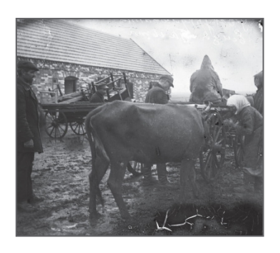
De-kulakization of peasants in the Donetsk region, 1930s