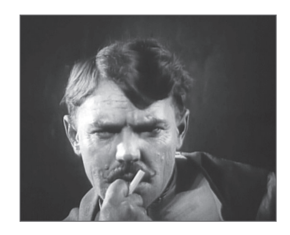
Benia Krik (a still from the film, Benia Krik, 1926)

The Odessa tales look back to the banditry of pre-war and pre-revolutionary days, when Odessa was in its heyday. There is no contradiction here between being a Jew in one's house and a man on the streets (in Yehudah-Leib Gordon's famous phrase, taken up by the maskilim ). This empowered masculinity is something the Odessa Jewish gangsters have in common with the Cossacks in the Red Cavalry stories, with whom they share their raspberry waistcoats and muscularity. In both cases, the bespectacled Jewish intellectual finds it difficult to overcome Jewish scholasticism and impassivity. The Bolsheviks, however, had no poetic nostalgia for Odessa's past or for anarchy, and gradually the later Odessa tales become tinged by a note of sad regret for what has been eradicated in the name of the Soviet future. "The End of the Old Folk's Home" ("Конец богадельни") and "Froim Grach" relate the end of an ethos, the end of an era.