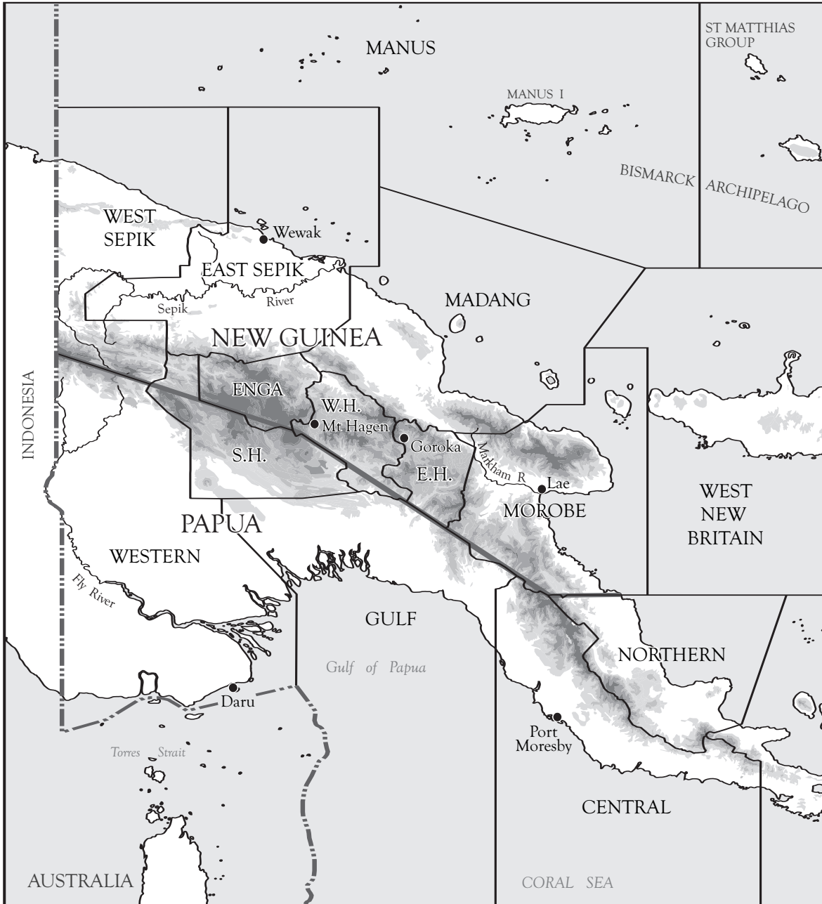
Map 1: The provinces of Papua New Guinea