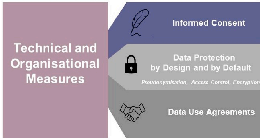
Fig. 2. Technical and Organizational measures and safeguards for processing neuroimages.

significant utility of the data and ensure respect for the principle of data minimisation thereby contributing to data protection by design.