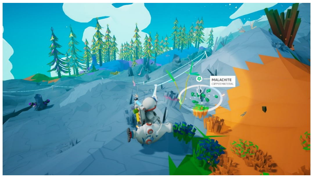
Figure 2: The "Terrain Tool" in action.