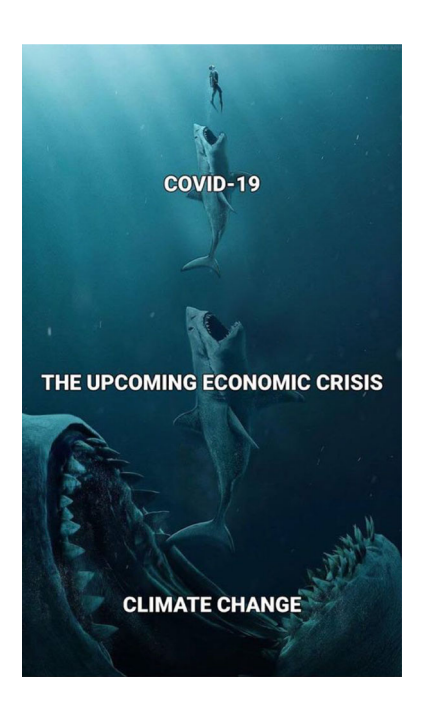
FIGURE 1 Social media meme framing global crises in health, economy and climate as interconnected.

they are perceive the message as from their ingroup or outgroup (Fielding et al., 2020). Indeed, climate emergency framing to a large extent has been embraced by progressive sides of politics more than conservative, so emergency framing may be more effective at mobilizing progressives than engaging conservatives, who may require other approaches.