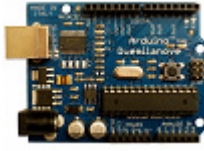
Fig. 2. Arduino micro-controller.

8. CUDA (Compute Unified Device Architecture)[20]: We used a dll file of CUDA where the code was imported. The CUDA platform was used to enhance the efficacy of the system while using in real time and remove time lag. Our project of a BCI system followed the given chronology for execution: