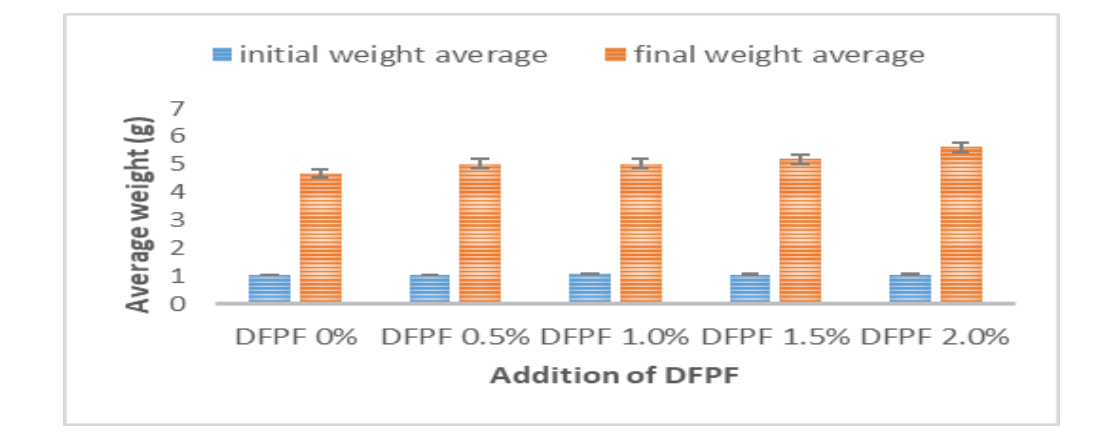
Figure 2. Enhancement Growth of Snakehead with Addition of Dragon Fruit Peel Flour (DFPF)

The growth of snakehead which was given the addition of dragon fruit peel flour showed a significant increase in changes in the initial and final weight means as shown in Figure 2.