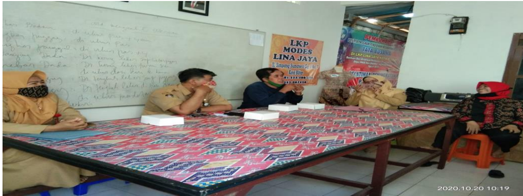
Figure 2. Discussions between ladies and gentlemen in PKK activities from three sub-districts (Sananwetan, kepanjen Kidul, and Sukorejo) in Blitar

The photo above illustrates that the belief in respect for men is still strong because they strongly believe in local wisdom belief since a long time ago even though they work in an equal place.