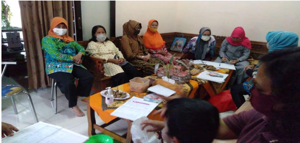
Figure 3. The activities that illustrate the equality between women and men status from Sananwetan District