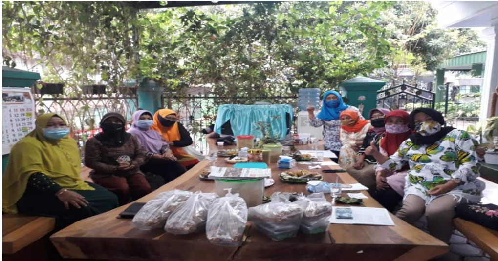
Figure 4. The activities that illustrate the inequality between women and men status from Kepanjen Kidul and Sananwetan Districts (Wienanda, 2012) and (Witjatmoko, 2016) divides the three stages gap from 0-15%. consider as balance, 16-25% gap consider to fairly balance, and > 25% gap is considered as imbalance.