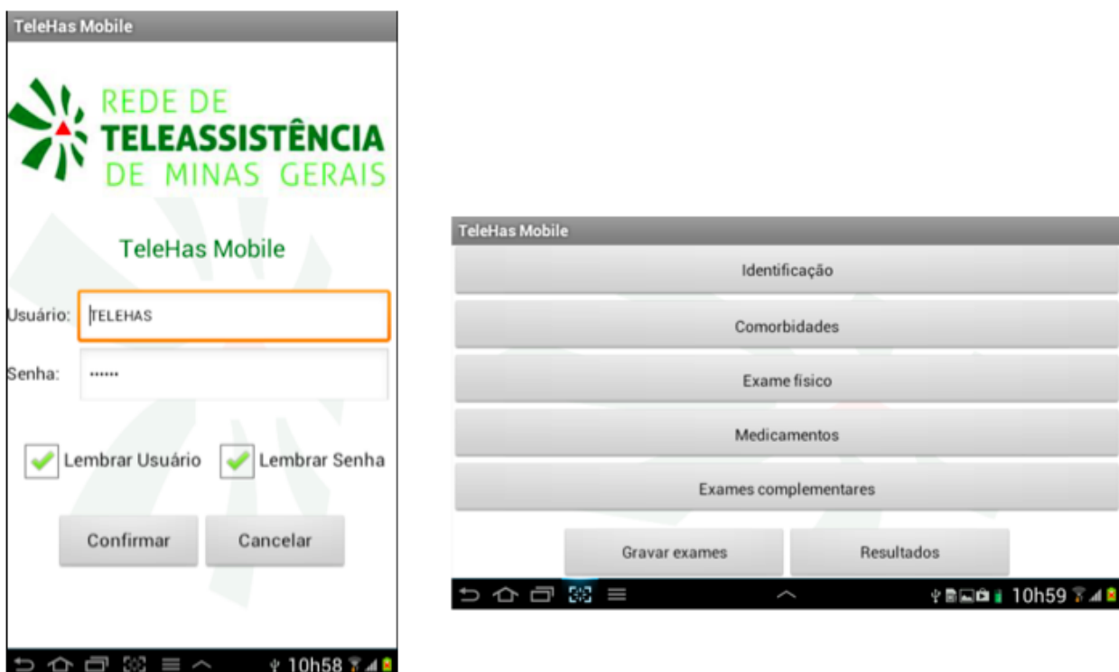
Figure 1. TeleHAS open screen and main menu.