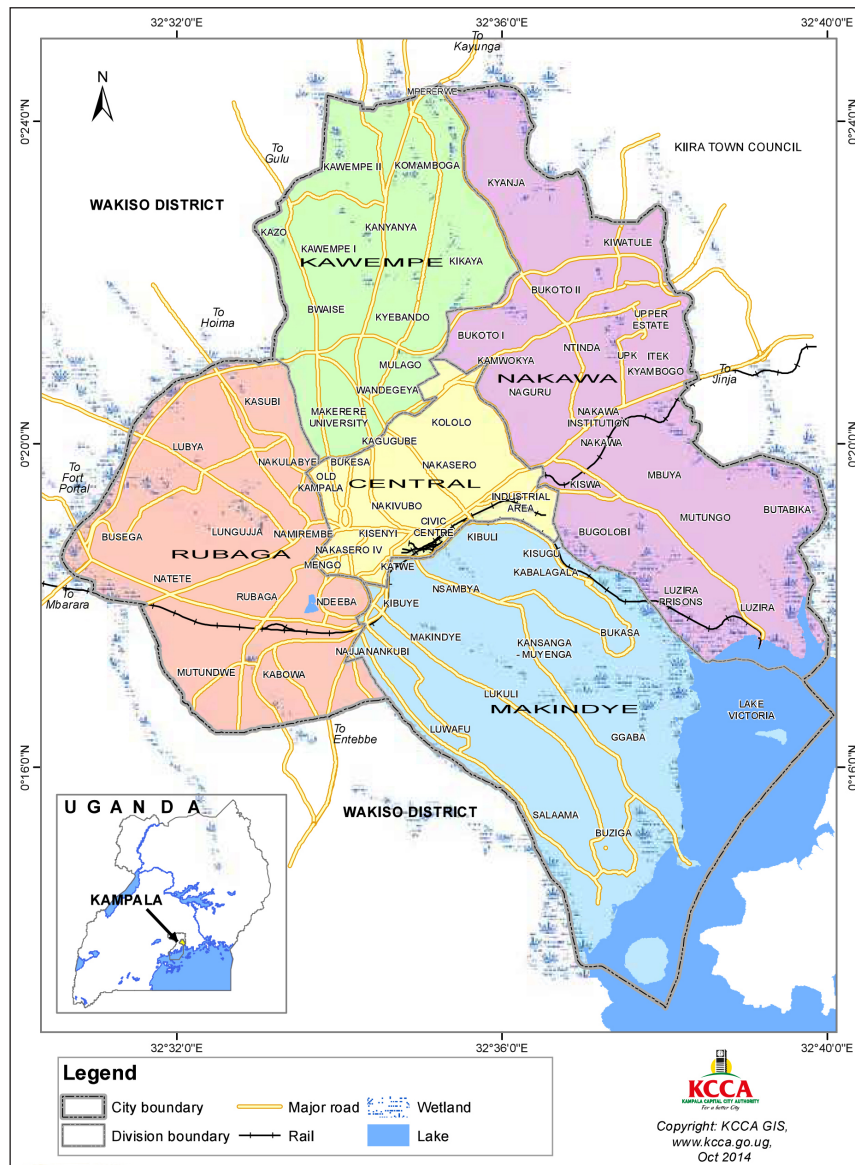
Figure 1. Map of the study area in Uganda showing location of divisions. Adapted from KCCA (2014)

While there were 1 897 NWSC customer connections in the study area, all of the 11 856 water connections in Kampala City Centre were taken as the population size ( N ), giving 372 connections as the sample size ( S ) from Krejcie and Morgan tables (320) plus 50 additional connections as a factor of safety. Cluster random sampling was used where the whole geographical population was divided into clusters (wards). A random sample from each cluster of 62 NWSC customers was performed (Wilson, 2010). This was done according to whether the customer had a water storage tank, accessibility and willingness to participate. This sample size was considered statistically significant and representative of NWSC customers in the study area and useful in drawing correct conclusions (Krejcie and Morgan, 1970). At a confidence level of 95% with an error of 0.05, the sample size gave valid and reliable results for a generalized population.