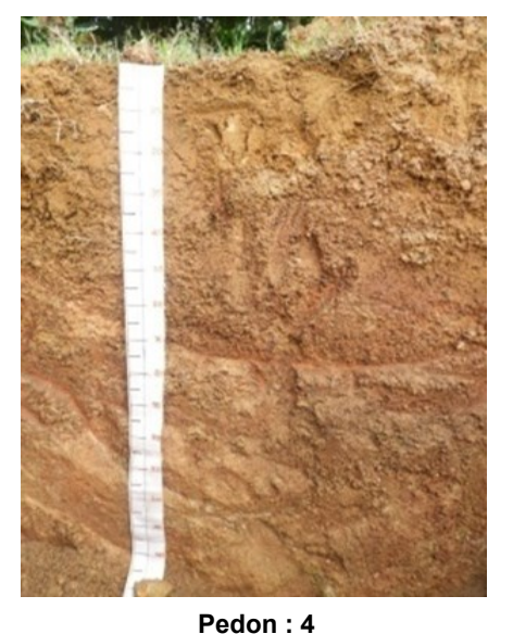
Pedon : 3 Pedon : 4 Plate 1. Pedon 1 -4.Eachprofileshowing the clearly smooth wavy boundary,, roots and clay cutans.

content in the subsurface horizons when compared to surface horizons. A similar result of the low clay content of soil and low organic carbon content status was the reason to the weak structural formation of pedons in Alluvial Soils of Rajasthan in India(Samrah et al., 2019).