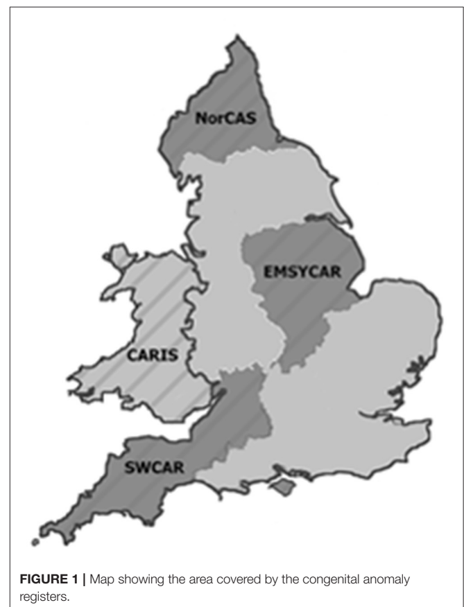
FIGURE 1 | Map showing the area covered by the congenital anomaly registers.

The British and Irish Network of Congenital Anomaly Research Database (BINOCARD) was a collaborative network of regional population-based congenital anomaly registers (16), which was superseded in England by a national system, the National Congenital Anomaly and Rare Diseases Registration Service (NCARDRS) in 2015 (17). Each regional register prospectively collected data on congenital anomalies occurring in the pregnancies of women residing in their geographically defined populations ( Figure 1 ). Data were obtained from three registers in England and the register for Wales, covering ~28% of the birth population of England and Wales. The Northern Congenital Abnormality Survey (NorCAS), established in 1985, covered 32,000 births per year in the North East of England and North Cumbria; the East Midlands and South Yorkshire Congenital Anomaly Register (EMSYCAR), established in 1997 covered 74,000 births per year; the South West Congenital Anomaly Register (SWCAR), established in 2002, covered 50,000 births per year in South West England; and the Congenital Anomaly Register and Information Service (CARIS), established in 1998, covers 35,000 births per year in Wales. Each register recorded up to eight congenital anomalies for each case. Anomalies were coded using the WHO International Classification of Disease (ICD) version ten, consistent with the