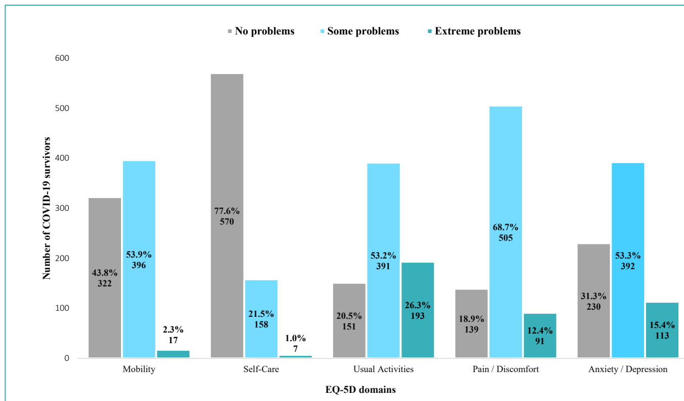
Figure 1 COVID-19 survivor response to EuroQol group five dimensions three level (EQ-5D-3L) (n=735).

health condition and number of weeks since COVID-19 diagnosis ( p < 0.05 , p < 0.001 ) (table 5).