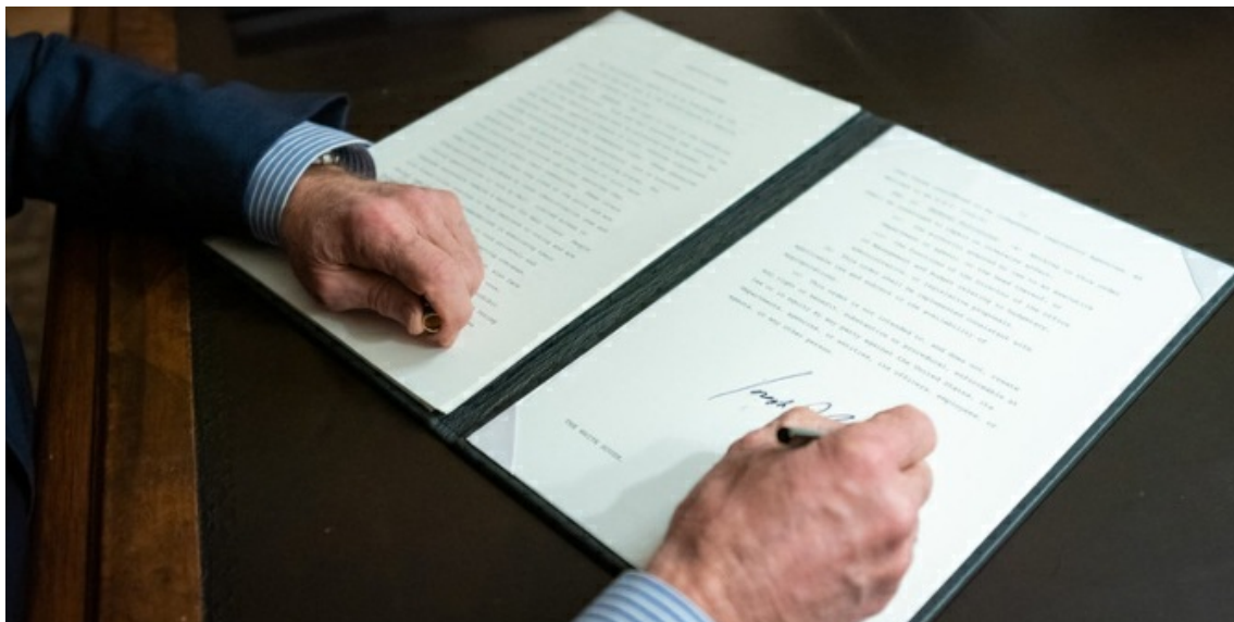
"P20210306AS-0931" by The White House is United States Government Work .

As described in The Federalist , the task was to supply energy to a government that lacked it under the Articles of Confederation. The Federalists described legislatures as a greater threat to an executive than a powerful executive would be to the legislature. One could say they sought to infuse a republic with attributes of monarchies more than they feared the prospect of monarchy. When the Antifederalists protested that an energetic executive was inconsistent with the genius of republican government, Hamilton responded that they better hope that were not true because an energetic executive is indispensable to the success of any republic. I want to stress here that The Federalist does not focus one's attention on the assignment and definition of power as the main source of this energy. Rather a more complex picture is depicted — an architecture of structures, dispositions, and powers — with more emphasis on structure than power. "The ingredients which constitute energy in the executive are unity; duration; adequate provision for its support, and competent powers" says The Federalist . The emphasis is on structure, the first three items of that list.