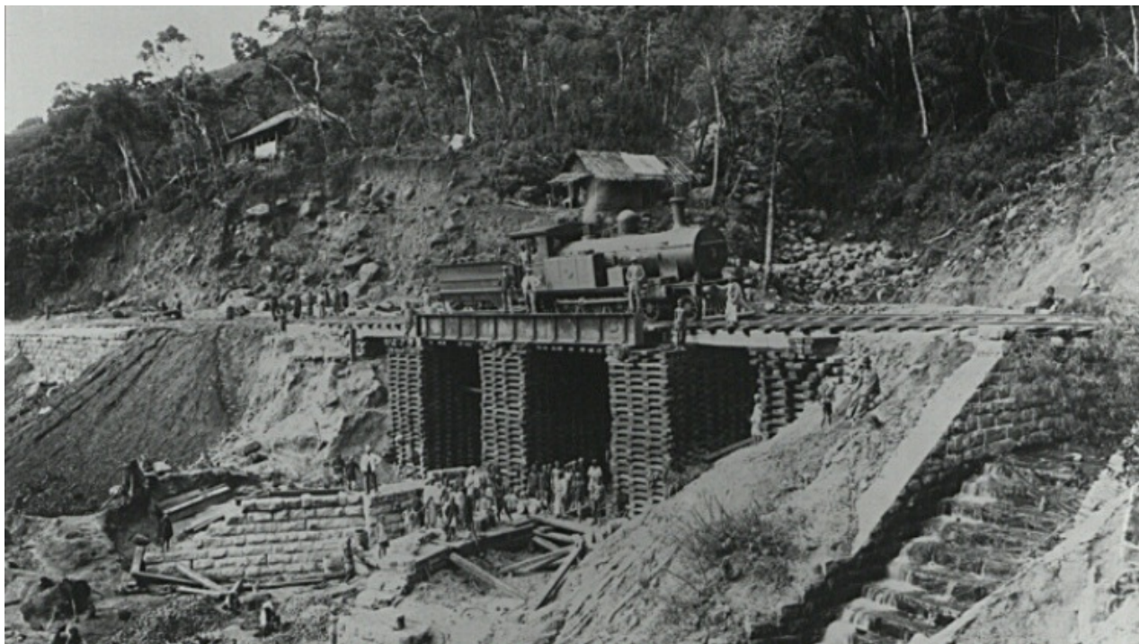
Building of a railway bridge in Sri Lanka (then 'Ceylon'). Crop of photograph ' CO 1069-573-22 '

The book also tries to understand the interconnectedness of globalisation and colonialism. The authors reject the claim that globalisation was a one-sided exchange between the colonies and the colonial power. The book also pays attention to the dynamics of growth and development in the colonies during the colonisation and subsequent decolonisation periods. The book further iterates that colonial states did not merely exploit or benefit from the local population. It is suggested that the interests of colonial governments might not necessarily be antithetical to economic growth in their colonies: 'Colonialism offered little in the way of political or civil rights to most indigenous inhabitants of the colonies, although there were opportunities of social mobility which may have given some individuals greater political voice than they had under pre-colonial systems, which were in many cases neither democratic nor egalitarian' (69). Even minimal colonial interventions in education and healthcare played a role in improving the standards of living for at least some sections of the people living in some of the colonies.