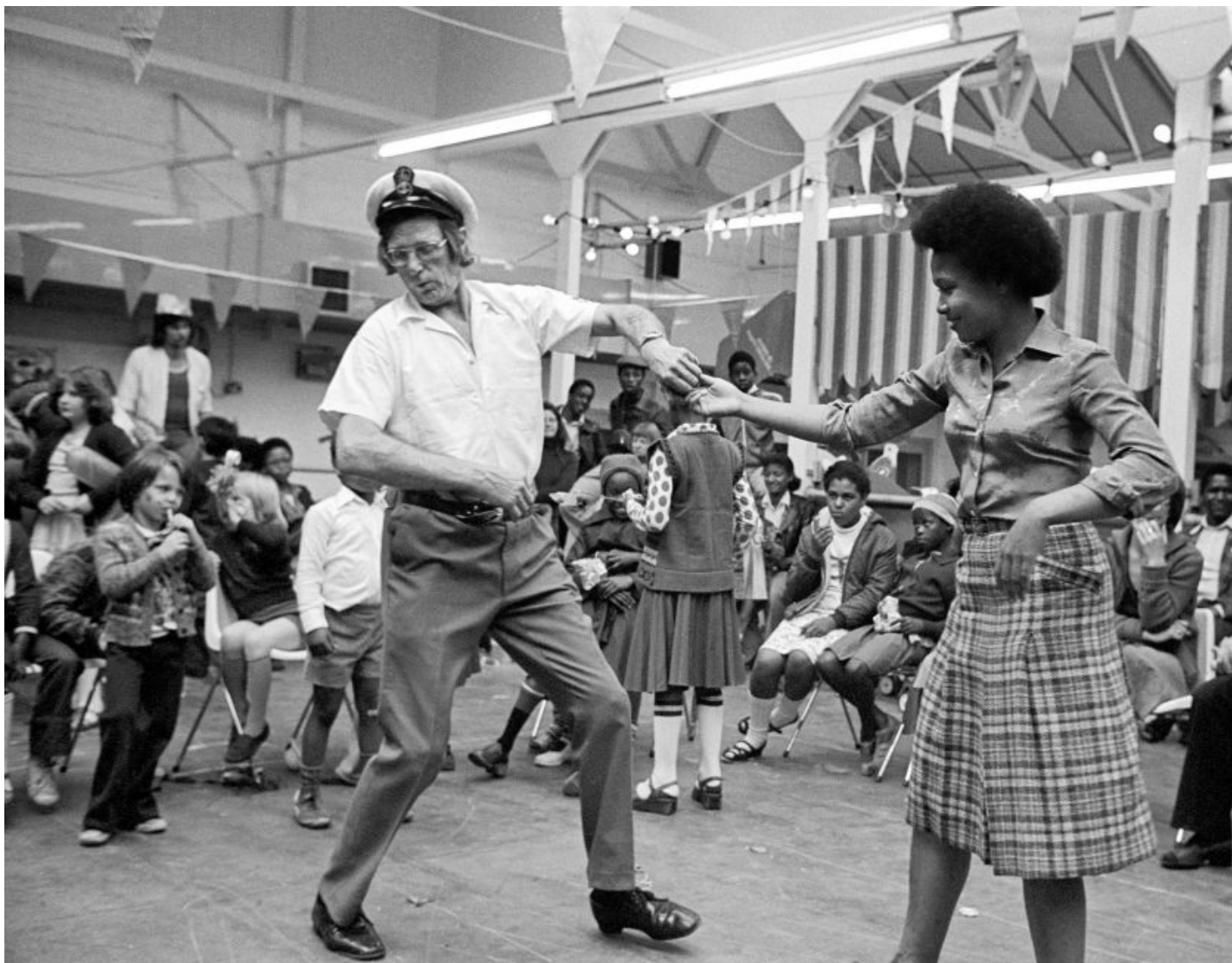
1978: Paddington-by-the-Sea community festival at the Factory, now the Yaa Asantewaa Centre. 'Paddington by the the Factory, West London, 1978.

Drawn from Stacey's doctoral thesis, enriched with interviews with key actors and numerous photographs gathered from various personal and institutional archives, the book offers a compelling micro-history of the Half Moon Photography Workshop, the Exit Photography Group, the Hackney Flashers Collective, the North Paddington Community Darkroom and the Blackfriars Photography Project, while never losing sight of the wider national context. The author exploits primary documents from varied sources: archival material, reviews of exhibitions in the press and articles from the specialist magazines Creative Camera and Camerawork , where debates on the politics of photography and the transformation of photographic practices were rife.