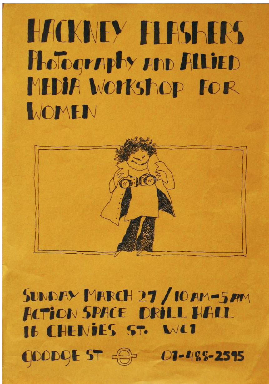
Image Credit: Workshop poster for the Hackney Flashers, illustration by Christine Roche.

Similar positions informed the values of the Hackney Flashers, an all-women feminist collective, which also had strong connections with the Half Moon Photography Workshop. Through their two shows ('Women and Work', 1975, and 'Who's Holding the Baby', 1979) and the educational material that they conceived, the Hackney Flashers produced a collective vision, through photography, graphic design, montage and the use of statistics, which confronted the invisibilisation of women's labour and exposed gender inequalities. Their work was concerned with amplifying the Women's Liberation Movement's demands regarding domestic work, reproductive rights, equal pay and childcare and with combatting the misrepresentation of women.