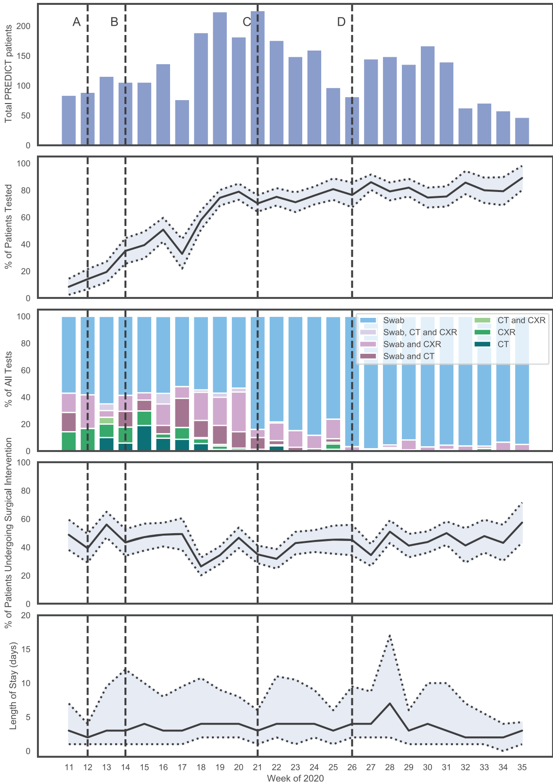
FIGURE 2. Details of findings related to Processes and Outcomes. From above down: 1) Weekly number of emergency adult surgical patient entered into the study (Interval represents 95% confidence intervals of proportions); 2) and 3) Longitudinal trends