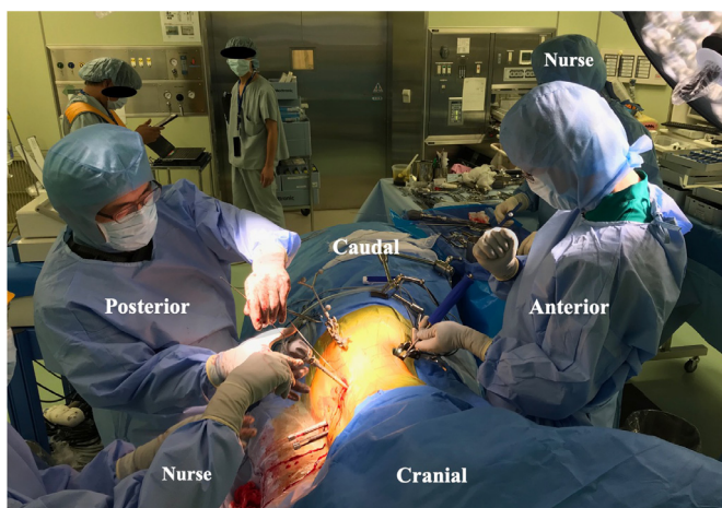
Fig. 2. Two surgeons are independently and simultaneously performing the anterior LLIF cage insertion and posterior percutaneous pedicle screw insertion.