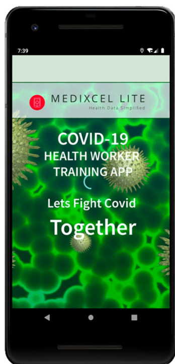
Figure 2. Home page of the InStrat COVID-19 tutorial App.

via WhatsApp, email and SMS by the staff of InStrat to download onto their android mobile phones. This was to enable them to log into the app and work their way through the module, which also tracked their progress automatically. We estimated that it would take the participants at least 60 minutes to complete the module.