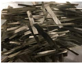
25.4-mm chopped fibres