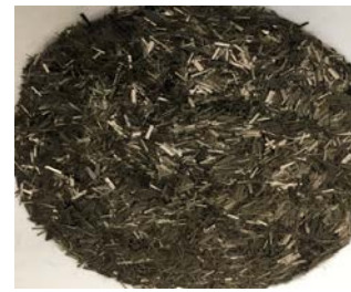
6.7-mm chopped fibres