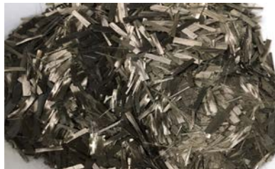
12.7-mm chopped fibres