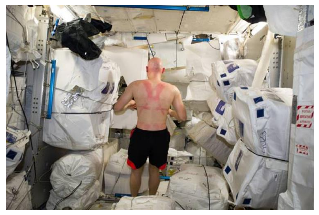
Figure 2 Typical chaffing and pressure marks on a crewmember's body, right after completing a T2 workout.