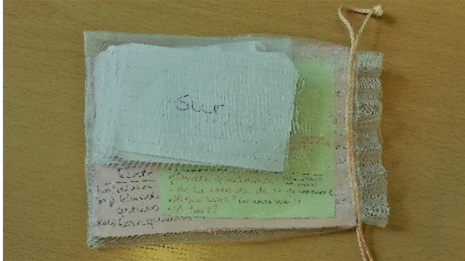
Figure 1: Lucy's set of Flashcards

Lara explained that she used color coding to differentiate the two languages and also to differentiate gender. She made flashcards more fun by writing the content diagonally across the cards and drawing some pictures next to the questions.