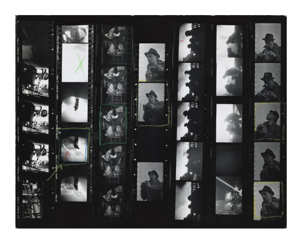
Figure 5. Bert Hardy, Contact sheet with versions of the cover image of "Picture Post", 1 February 1941, photographic contact sheet. Collection of Getty Images Hulton Archive. Digital image courtesy of Getty Images Hulton Archive (All rights reserved).

The firefighters were not a professional service at this point in the war. The National Fire Service was established in autumn 1941, but in February, the fires were being fought by local fire brigades augmented by the volunteers of the Auxiliary Fire Service (AFS). The AFS came from "all walks of life" and they were the "front line of defence" between London and the Luftwaffe. <sup>31</sup> They were ordinary heroes, everyday men and women showing extraordinary courage; they were individuals and they were the nation. These are the faces on the cover of Picture Post , which are focused on in our extended opening shot. And these are the bodies in Hardy's photo-story, which fade in as silhouettes after the title frames, before being revealed as set within a complex layout that includes a headline, text and a full-page advertisement for "The Wisdom Toothbrush".