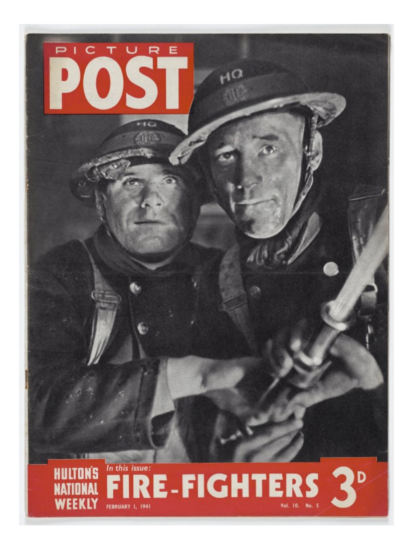
Figure 4. Picture Post (cover), 1 February 1941, featuring photograph by Bert Hardy. Collection of Getty Images Hulton Archive. Digital image courtesy of Getty Images Hulton Archive (All rights reserved).