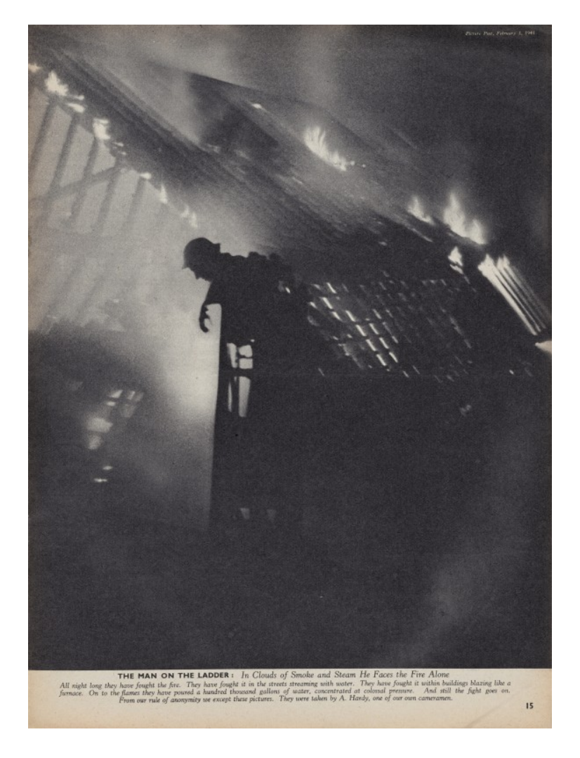
Figure 6. Bert Hardy, The Man on the Ladder, from "Fire-Fighters!", Picture Post 1 February 1941 15 photographs, Collection

positioned? The impetus towards abstraction from the beginning to the end of this photo-sequence is so striking, as the narrative is overtaken by shadows and silhouettes, formlessness, and negative space. It is an image not so much of humanity and heroism, as of the night, the fire, and destruction. The outline of the torso of the firefighter could be a corpse, with its strange withered hand. The edges of the figure are blurred and grainy against the lights of the flames; photographic documentation has given way to a poetic and deeply expressive visual language.