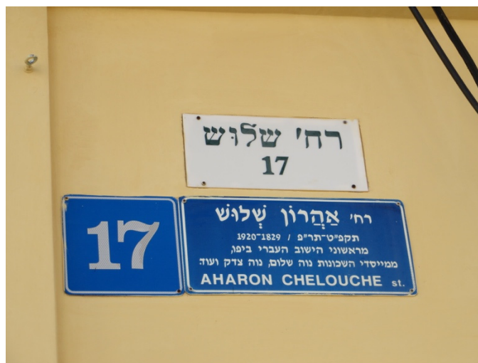
Figure 2. Nameplate for Chelouche Street in Neve Tzedek.

Abu George remembers this, too, and he remembers the way the neighbourhoods around Manshiyya were demarcated ethnically: “On Chelouche there were a lot of Europeans from Poland, that was the centre for Europeans. Shabazi was mixed.” (Interview, February 2018, Jaffa).