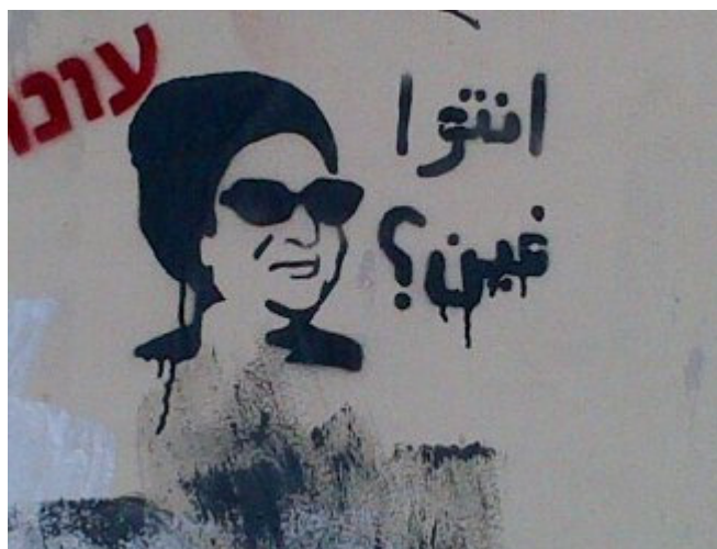
Figure 1. Umm Kulthum's face stamped on a wall as street art in Tel Aviv.

If one follows Josh Kun's directive to listen for buried histories, the sonic cues of ruin are everywhere (Kun 2000). A border between Tel Aviv and Jaffa is fragile not just because the urban geography of the two cities is unstable, but because the sensory experience of the "joined" cities bleeds gradations of Arabic language, culture and ethnicity that traverse and blur the border. With the painful memory of loss from "al-Atlal" as a backdrop to the "fractured synecdoche" (Mann 2015) of the "paper border" (Aleksandrowicz 2013), this article focuses on the way that sound, and particularly the intense sense memory of local sounds, shapes a border that is undefined and largely unpoliced. Employing ethnographic methods of the semi-structured interview, observation, and discourse analysis, the project of analysing the Arab sounds of Manshiyya is an attempt to capture the sensory dynamic of ruin.