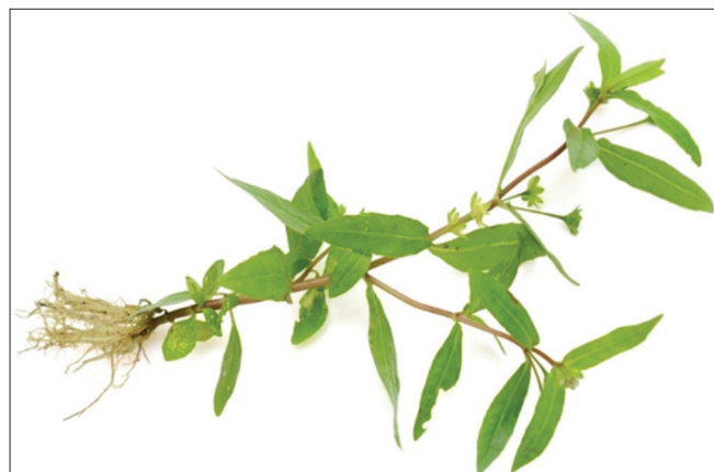
Fig. 1: Eclipta alba (Bhringraj)

E. alba (L.) is an annual multibranched herbaceous plant that reaches up to the height of 30–50cm. The form of this plant may be erect or prostrate. The plant is covered with hair of white color. The hair is present on both the surfaces of leaves. The stem is of red color. There is presence of simple, sessile, and lanceolate leaves which are of length 4–10 cm, breadth 0.8–2 cm, and tallness 90 cm with slender. The leaves