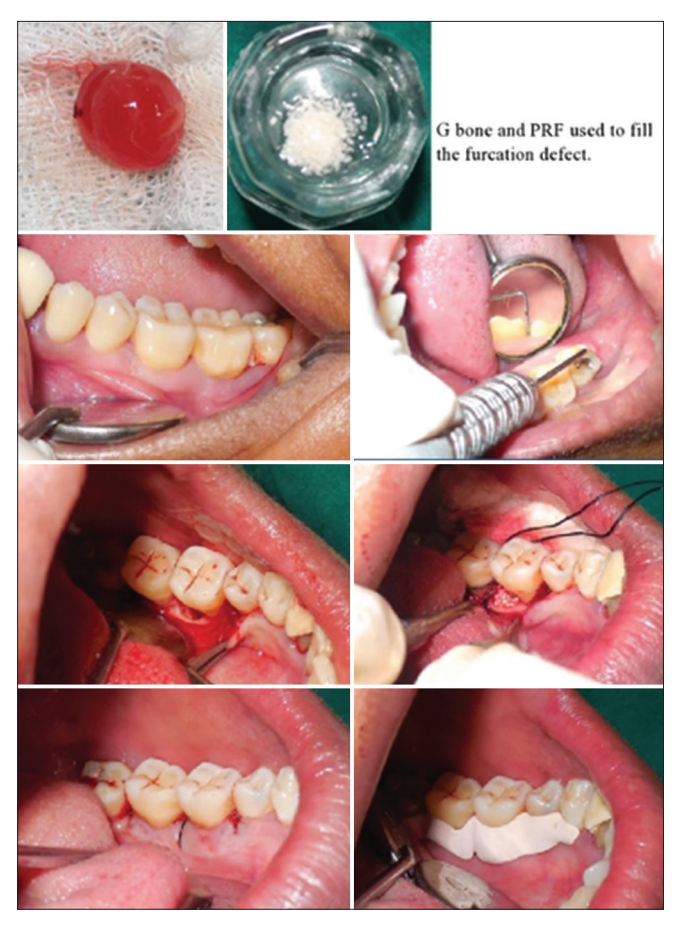
Figure 3: Regenerative procedures like Bone grafts along with PRF can be used to fill the furcation defects with an excellent outcome. In this case, we used a Bone graft (G bone) along with PRF.

Optical coherence tomography is another recent speculative aid that might be used in the future for the assessment of periodontal