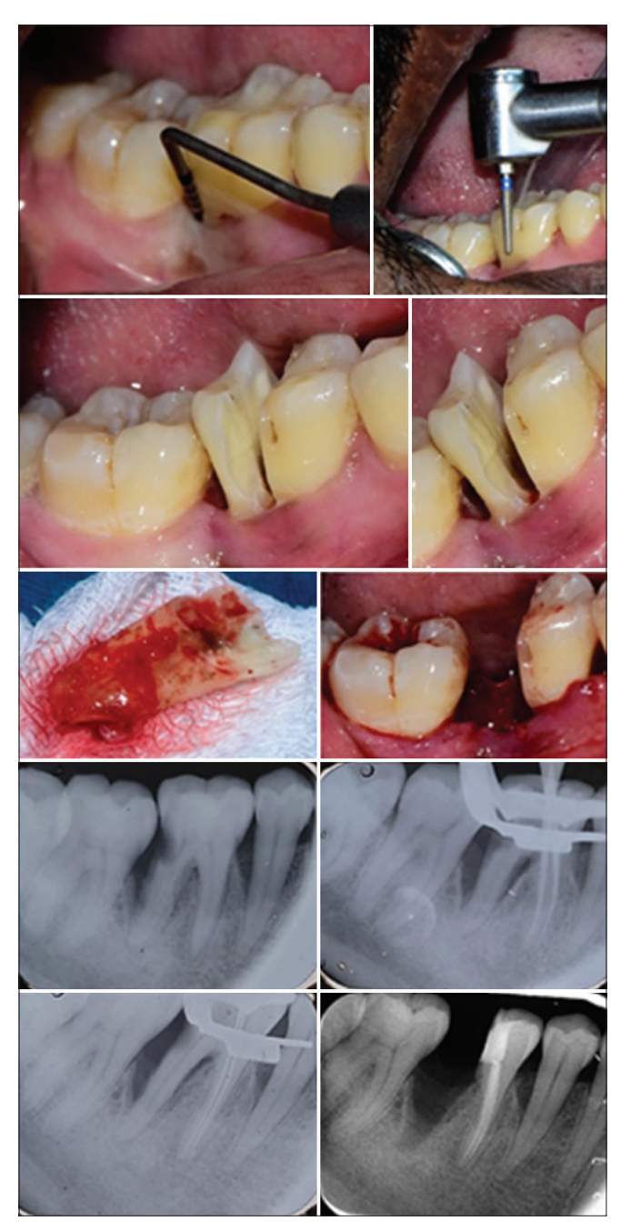
Figure 2: Hemisection of furcation involved teeth, with IOPA