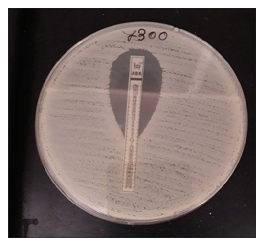
Fig. 2: Arbekacin E-test

Fig. 1: Multiplex PCR for the detection of carbapenemaseproducing genes. M, 100 bp DNA ladder lane: 6, 8, 10, 15, 16 NDM positive (603 bp) Lane: 9, 12 NDM+ 0XA-48 (265 bp) positive bacteria. Lane: 11, 18 positive control. Lane: 19 negative control