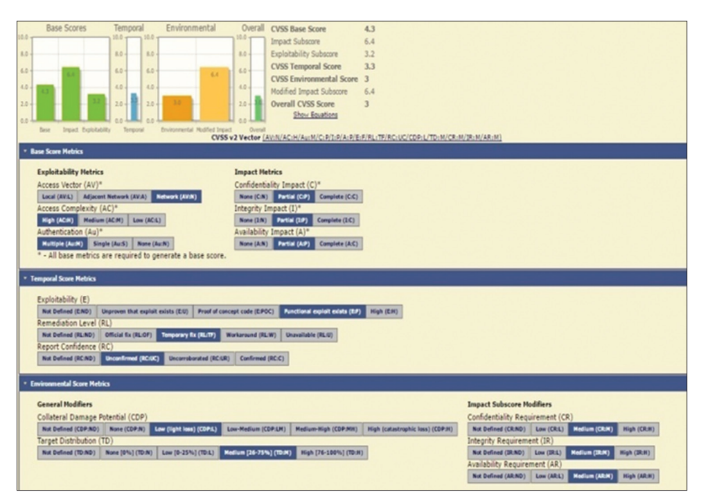
Fig. 4: Evaluation of the vulnerabilities using common vulnerability scoring system