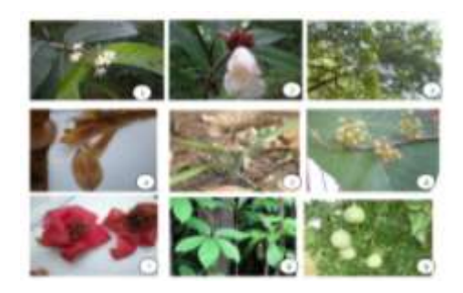
Fig.2: Medicinal plants (1) Alstonia scholaris (L.) R. Br. (2) Cheilocostus speciosus (J.Koenig) C.D.Specht (3) Dioscorea pentaphylla L. (4) Ailanthus excelsa Roxb. (5) Crinum latifolium L. (6) Cyclea peltata (Lam.) Hook.f. & Thomson(7) Bombax ceiba L. (8) Ipomea pes-tigridis L.(9) Aegle marmelos (L.) Correa

Among 32 wild edible medicinal plants are used for curing various diseases as ailments by Irula tribes (Figure: 2)