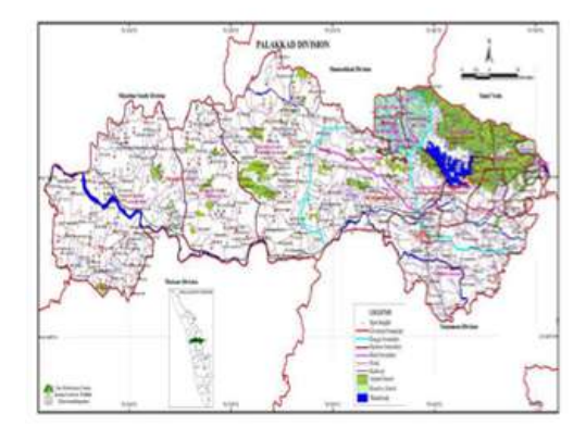
Fig.1: The map of Dhoni and Walayar Forest, Palakkad Forest Division, Kerala.

Palakkad Taluks of Palakkad Revenue District. The area lies between 10° 45' and 10° 55' North latitude and 76° 50' and 76° 10' East longitude.