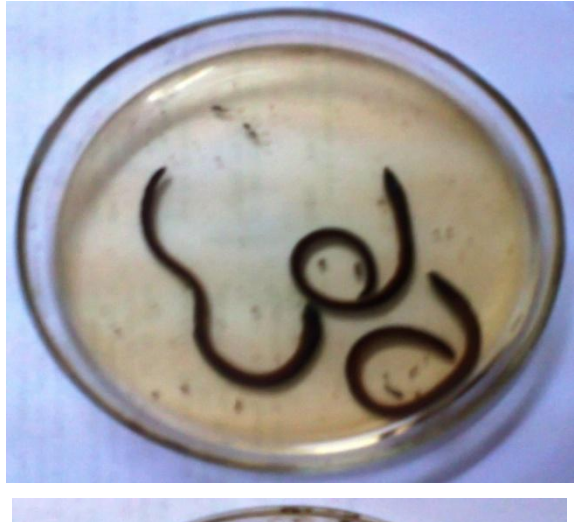
Figure 2: Showing the anthelmintic activity of piperazine citrate.

All values represent mean ± SEM; n=6 in each group. This activity was Concentration dependent. ***p<0.001